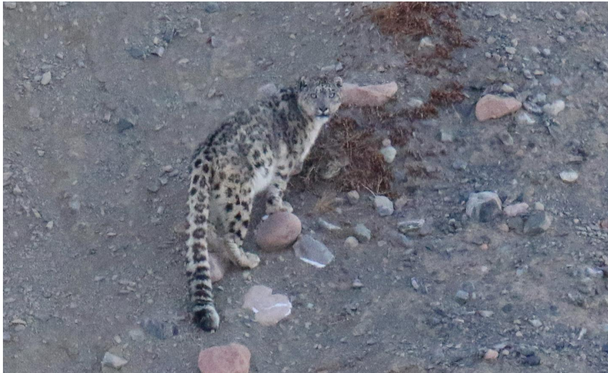
Snow Leopard walking on the mountain slope

In the morning of fourth day since we arrived in the valley, we were informed by one of the local herdsmen that his goat has been killed by a Snow Leopard around 8 km away from our camp in the bottom of the valley. We immediately drove there and parked our car at an elevated spot near the dead goat. Suddenly, a Snow Leopard started running away to the mountain slope as it heard and saw us. It has walked up on the barren slope and disappeared in the grey rocks that are located in a relatively flat area.