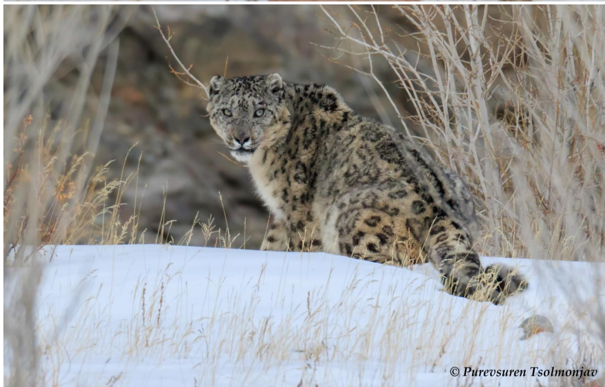
Snow Leopard photos taken during our trip in the Altai Mountains in March 2020