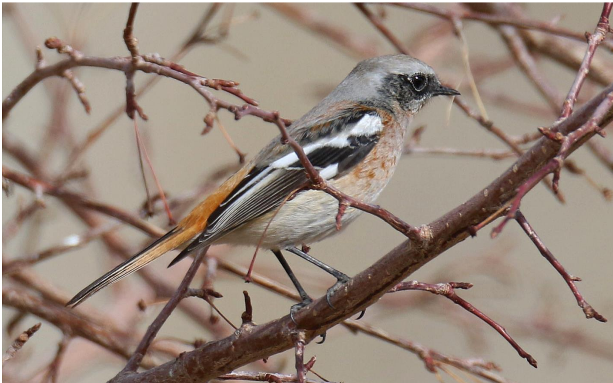
A male Eversmann's Redstart in Khovd town