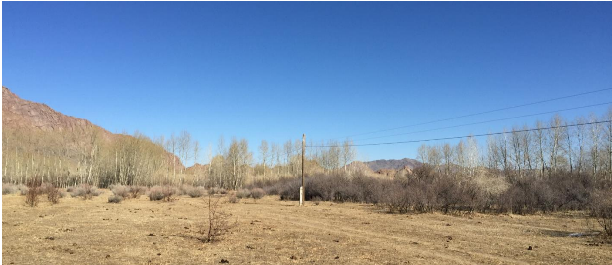
Otson Chuluu Tree Plantation in Khovd town

We continued our journey towards Khovd town and reached there in the late evening. On the following day, we visited the Otson Chuluu tree plantation and saw a single female Red-mantled Rosefinch, a few migrating male Eversmann's Redstarts, Long-tailed Rosefinch, Great Tit, Rock Dove, Hill Pigeon and other resident corvids.