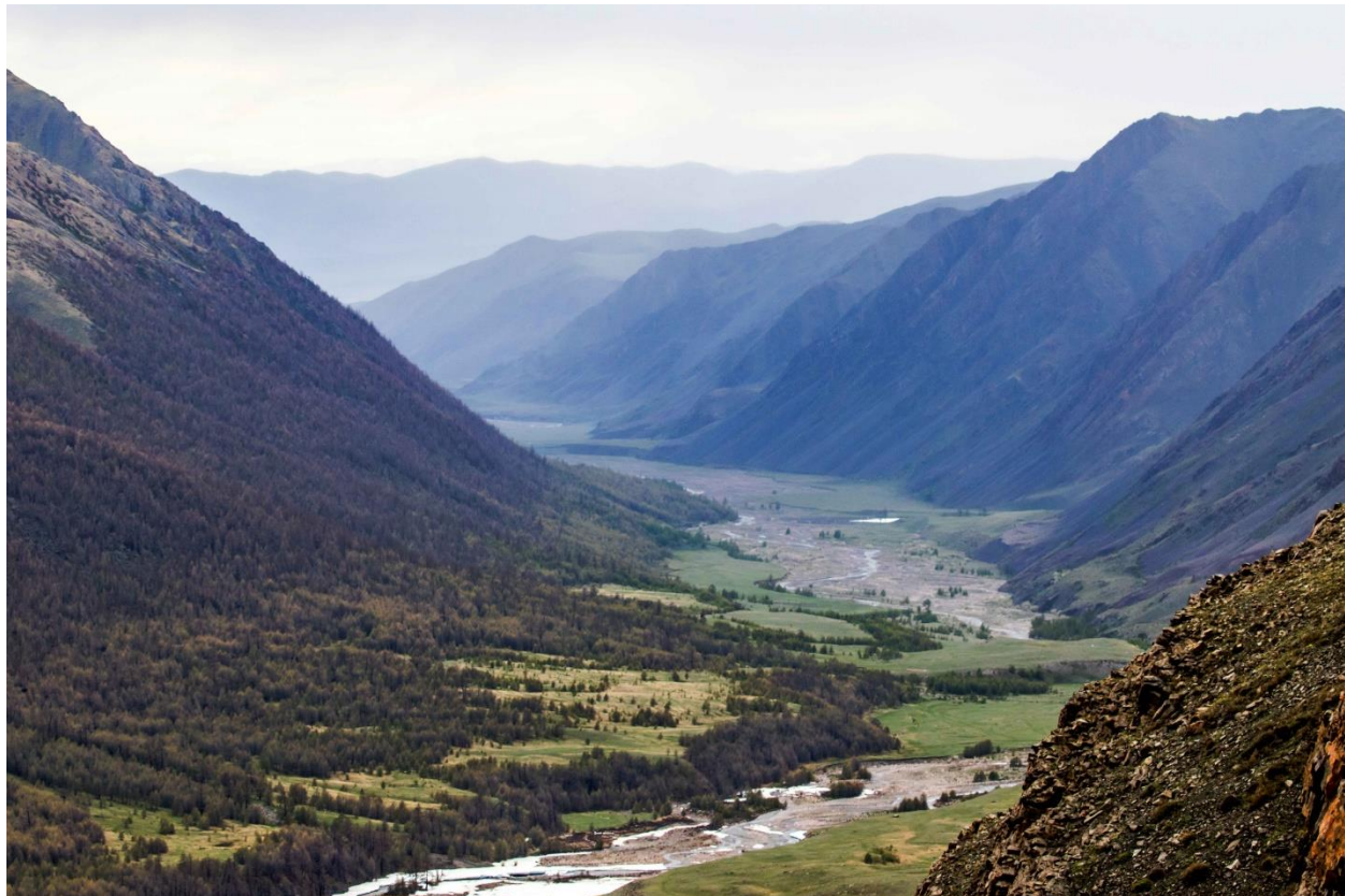
Our Snow Leopard Valley in the Altai Mountain

We explored the valley for next two days and talked to the local herders about their recent Snow Leopard sightings and livestock killed by Snow Leopards.