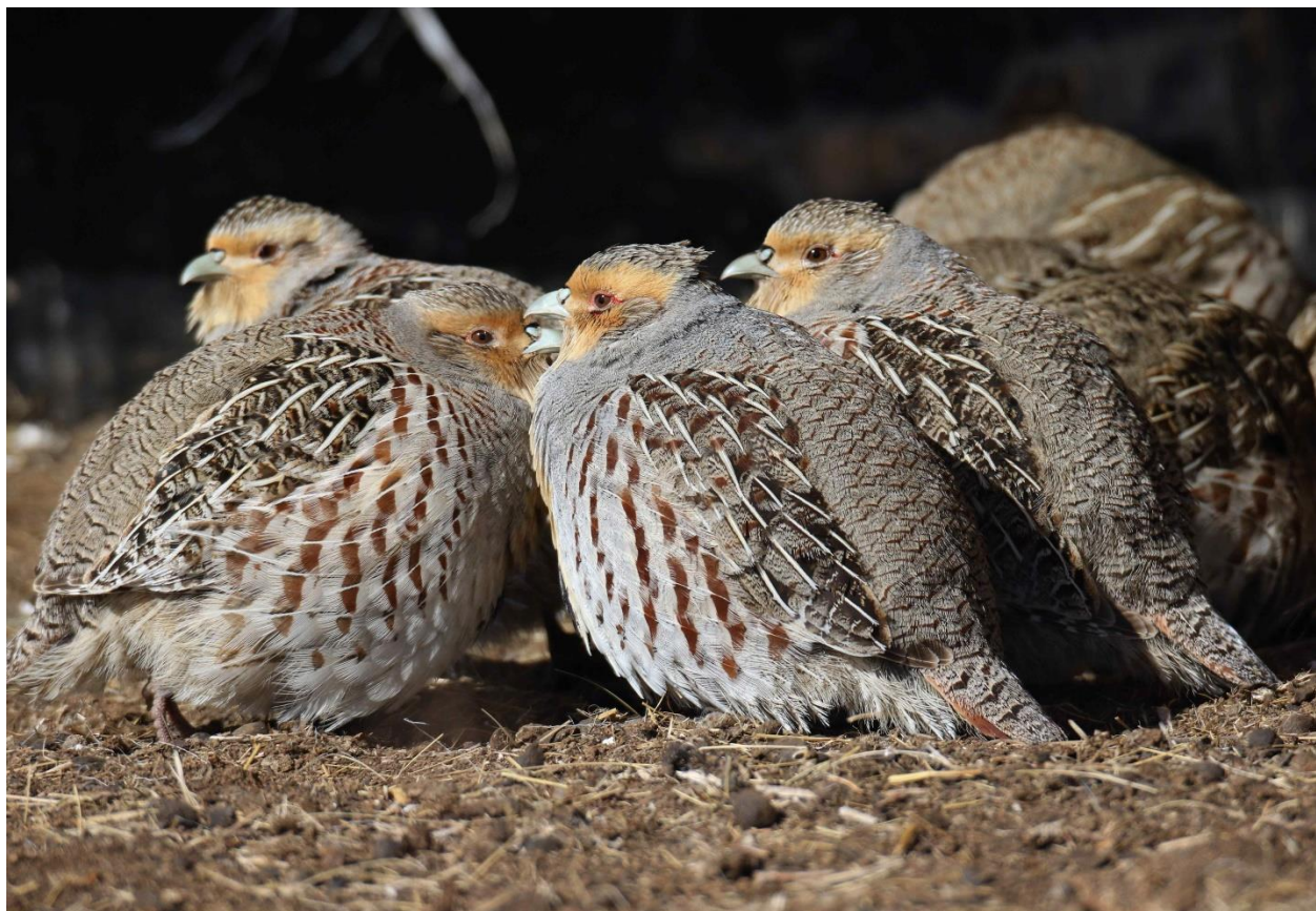
Daurian Partridges in the central steppe

Other wildlife we saw in this area were Red Fox, Corsac Fox, Tolai Hare and birds like Mongolian Lark, Small Snowfinch, Horned Lark, Asian Short-toed Lark, Golden Eagle, Cinereous Vulture, Red-billed Chough and Daurian Partridge.