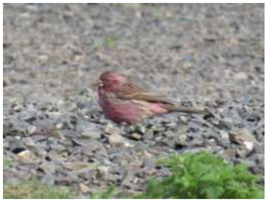
Chinese Beautiful Rosefinch