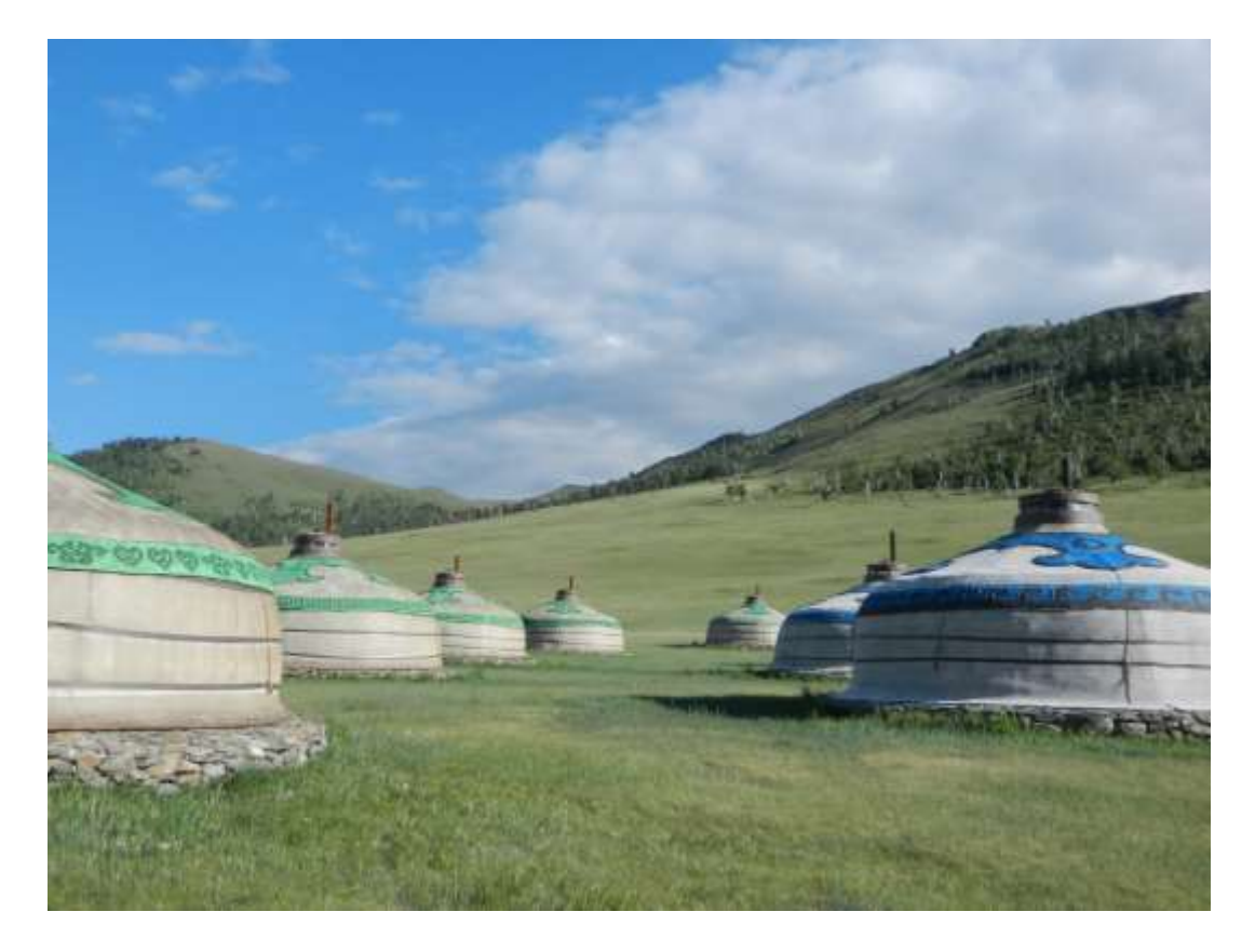
Ger camp near Ulaanbaatar