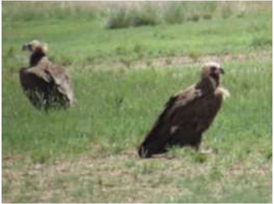
Eurasian Black Vulture