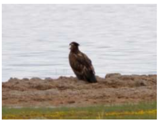
Great Spotted Eagle