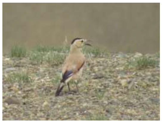
Henderson's Ground Jay