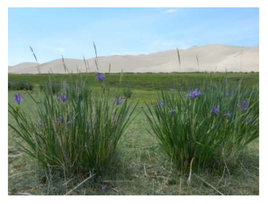
Ornitholidays' Tour to Mongolia 10 – 25 June 2014 Page 15