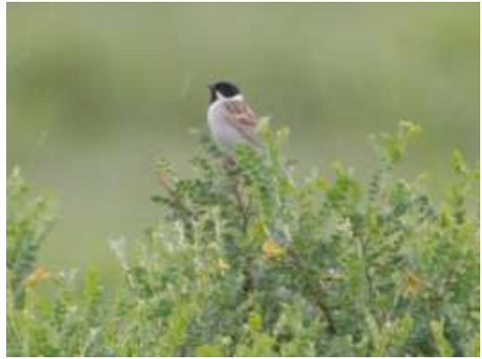
Pallas's Reed Bunting