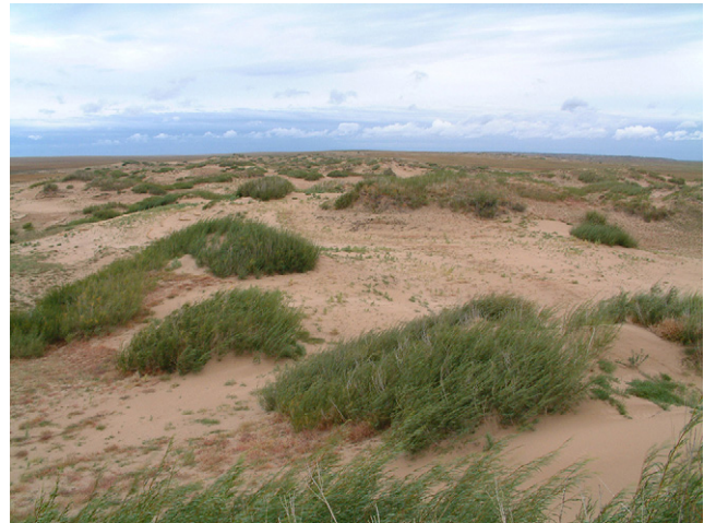
Fig. 1 – Shifting sand dunes typical of the study area.

The study area is located at Yaoledianzi village (42°55′N, 120°41′E, elevation 345 m), Naiman county, in the southwestern end of Horqin Sandy Land, Inner Mongolia, China, and