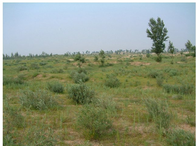
Fig. 2 – Fixed sand dunes in study area.

Two sites were selected on shifting sand dunes. One, with remnant shrubs C. microphylla and S. gordejvii , was fenced at the end of 1990 to protect it from grazing by livestock.