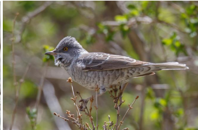
Breeding male Beautiful Rosefinch and Barred Warbler

After having lunch in Mukhar Shivert valley, we drove to another valley called Khavtsgait to see Grey-necked Bunting. Unluckily, we could not find it here and we needed to look for it somewhere else.