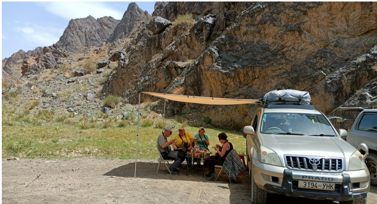
Lunch stop on the way to Khongor Sand Dune

We had early breakfast as usual and headed to our next destination – Khongor Sand Dune. We drove through the same valley – Khavtsgait for one more try to see Grey-necked Bunting, but again there was no sign of it. On the way, we saw numerous Pallas's Sandgrouse, several Goitered Gazelles and a small group of Asiatic Wild Ass. We had lunch in a beautiful valley close to the main road and I saw a few Siberian Ibex on a high cliff. Several Chukars were calling from the opposite slope and we saw no new birds here.