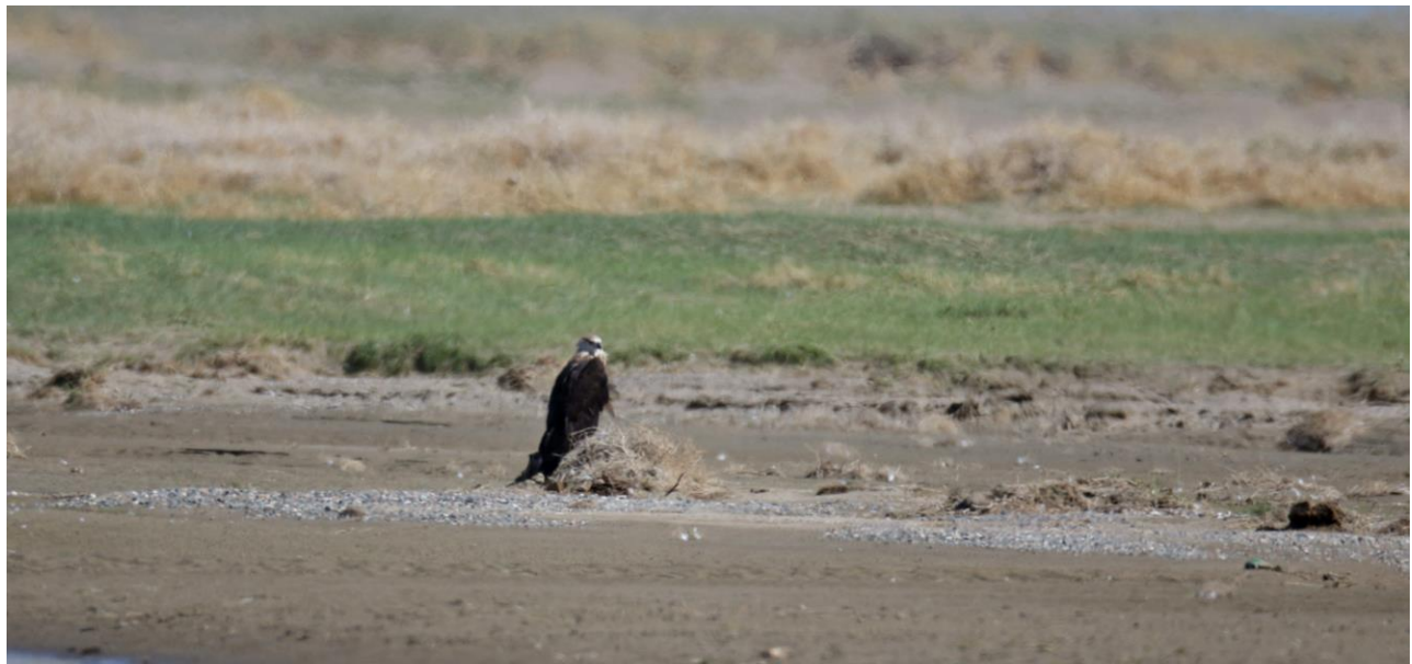
Pallas's Fish Eagle

We scanned all the bird gatherings several times, but no luck for Relict Gull this time. Other birds we saw here were Mongolian Gull, Pallas's Gull, Black-headed Gull, Brown-headed Gull, Caspian Tern, Common Tern, White-winged Tern, Swan Goose, Bar-headed Goose, Greylag Goose, Common Crane, Mallard, Garganey, Shoveler, Black-tailed Godwit, Pacific Golden Plover, Common Redshank, Black-winged Stilt, Pied Avocet, Eurasian Spoonbill, Kentish Plover, Greater Sand Plover, Tufted Duck and Common Pochard.