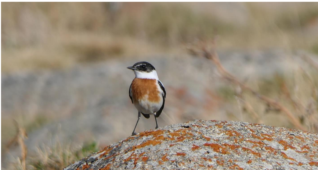
A breeding male White-throated Bushchat

site in the afternoon. After we quickly set up the camp in the valley, we went up the mountain top. After about 30 minutes of search, I found a breeding male White-throated Bushchat and called the others. We have seen a female as well and there were just nesting among some boulders.