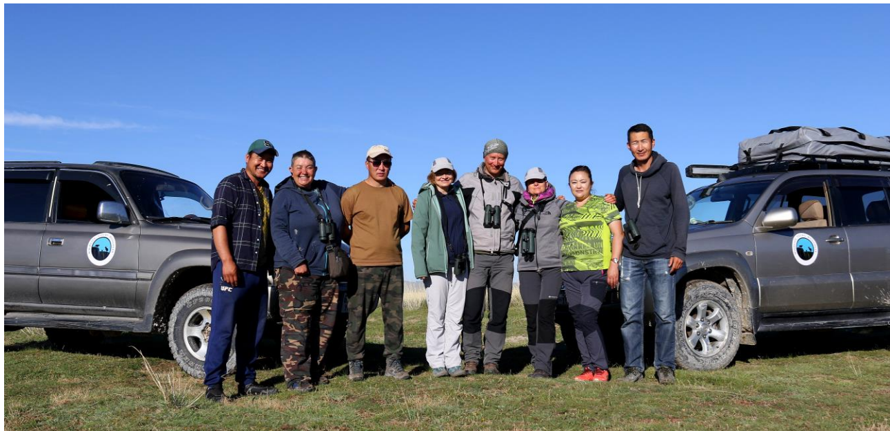
A group photo