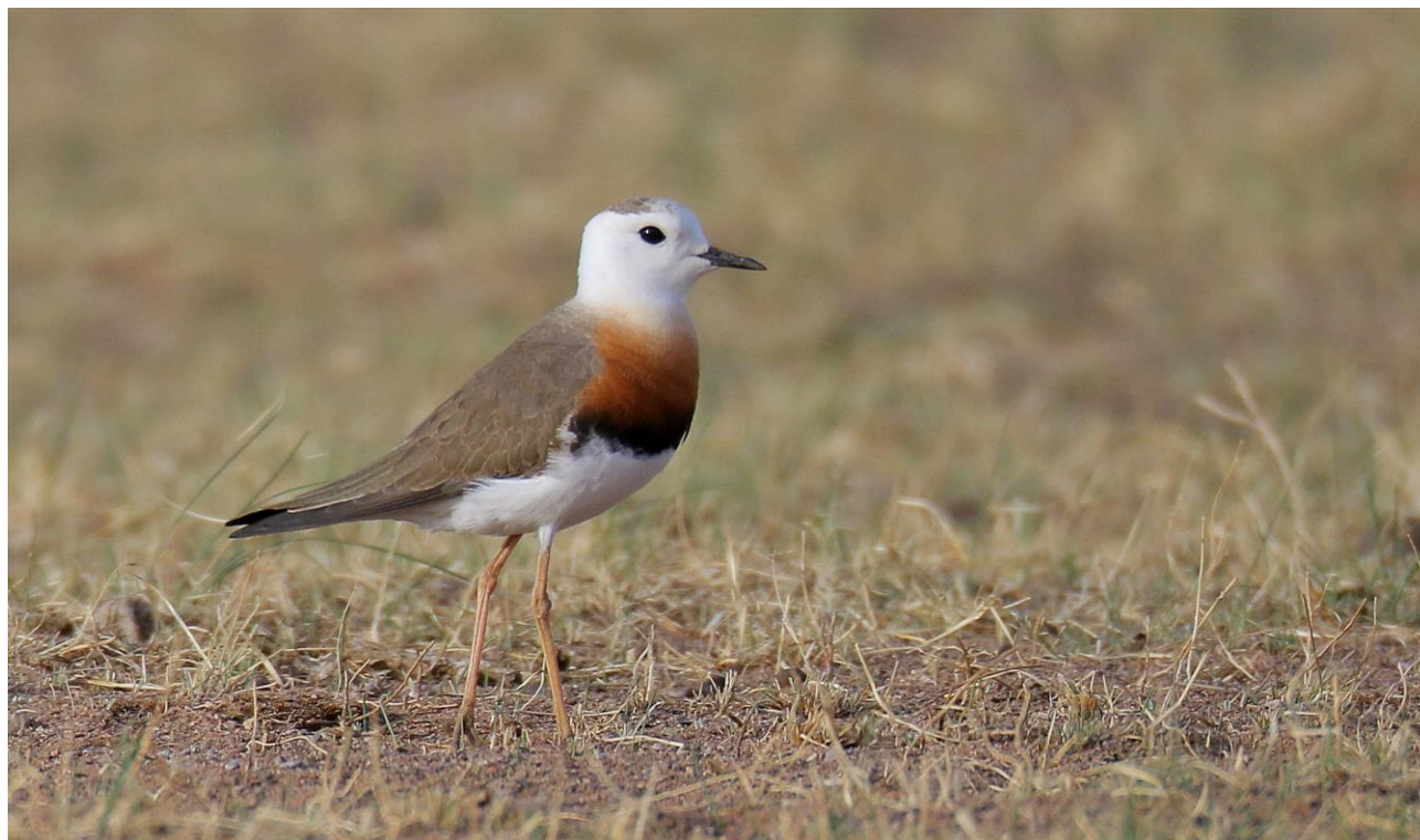
A breeding male Oriental Plover

over, it flew away, but landed not far from us. We all had an excellent view of this beautiful wader with the spotting scope and some even managed to take photos.