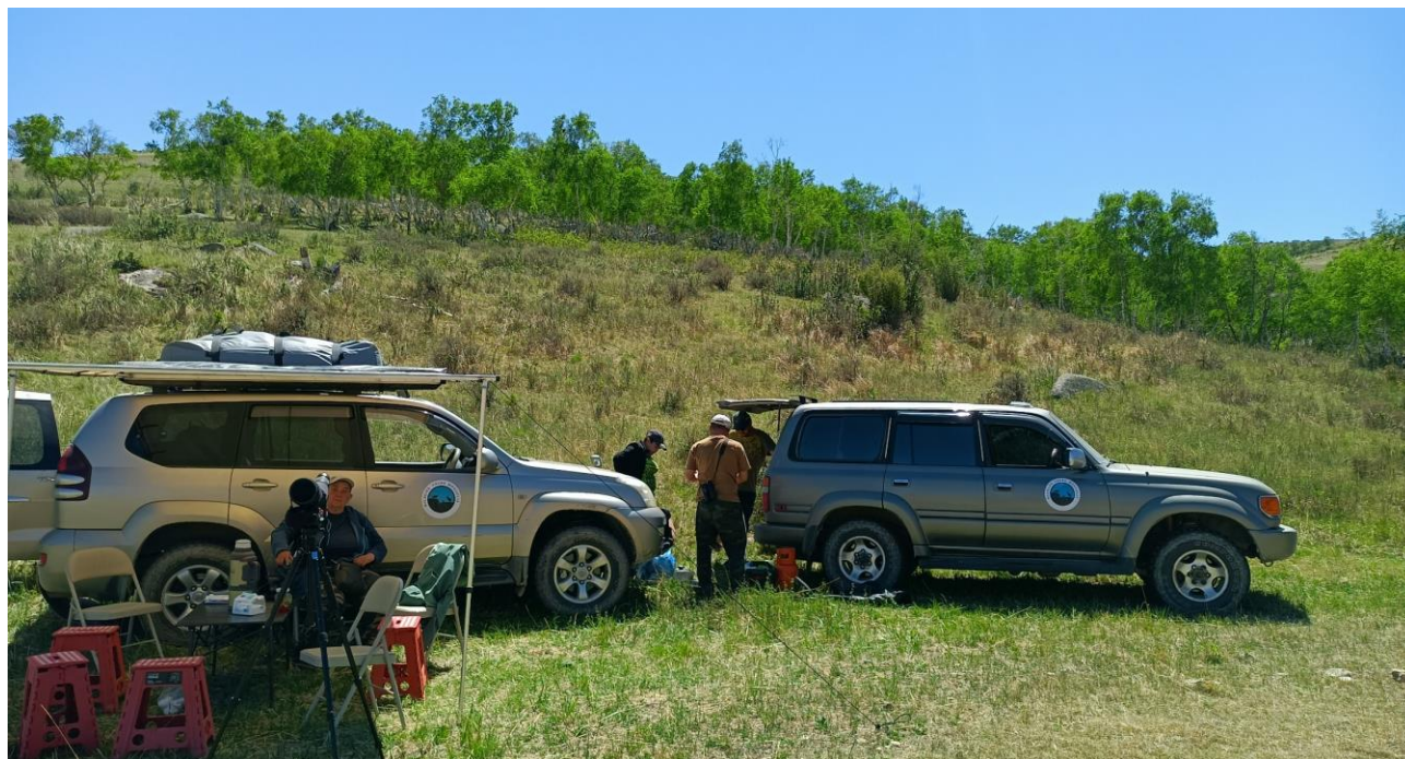
Lunch stop site in Hustai National Park

We had short walks around the camp before breakfast and we saw a few Pallas's Buntings close to the camp site. After breakfast, we headed to the Hustai National Park. We drove around the park and our target was to see Amur Falcon, Meadow Bunting and Daurian Partridge here. We saw a plenty of Mongolian Marmots, some Long-tailed Ground Squirrels, Przewalski's Horses and Siberian Wapiti Deer. At our lunch stop, we have seen all the target birds and as well as Eurasian Hobby, Common Kestrel, Golden Eagle, Cinereous Vulture, Steppe Eagle, Upland Buzzard, Common Whitethroat, Lesser Whitethroat, Isabelline Wheatear, Pied wheatear, Carrion Crow and Eurasian Magpie. We came to the Hustai ger camp before dinner and it was our last dinner together.