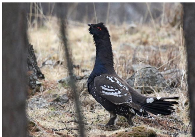
Male Black-billed Capercaillie in Terelj National Park

After seeing one of the most sought-after birds without much effort, we had short walks around the camp site until lunch. After lunch, we explored the forest and saw Olive-backed Pipit, Pine Bunting, Orange-flanked Bluetail, Willow Tit, Great Spotted Woodpecker, Three-toed Woodpecker, Eastern Buzzard, Black Kite, Rook and Common Raven during our walks. We encountered a few more male Black-billed Capercaillies as well. Just before sunset, a single male Black-billed Capercaillie posed on a tree before moving to its roosting spot.