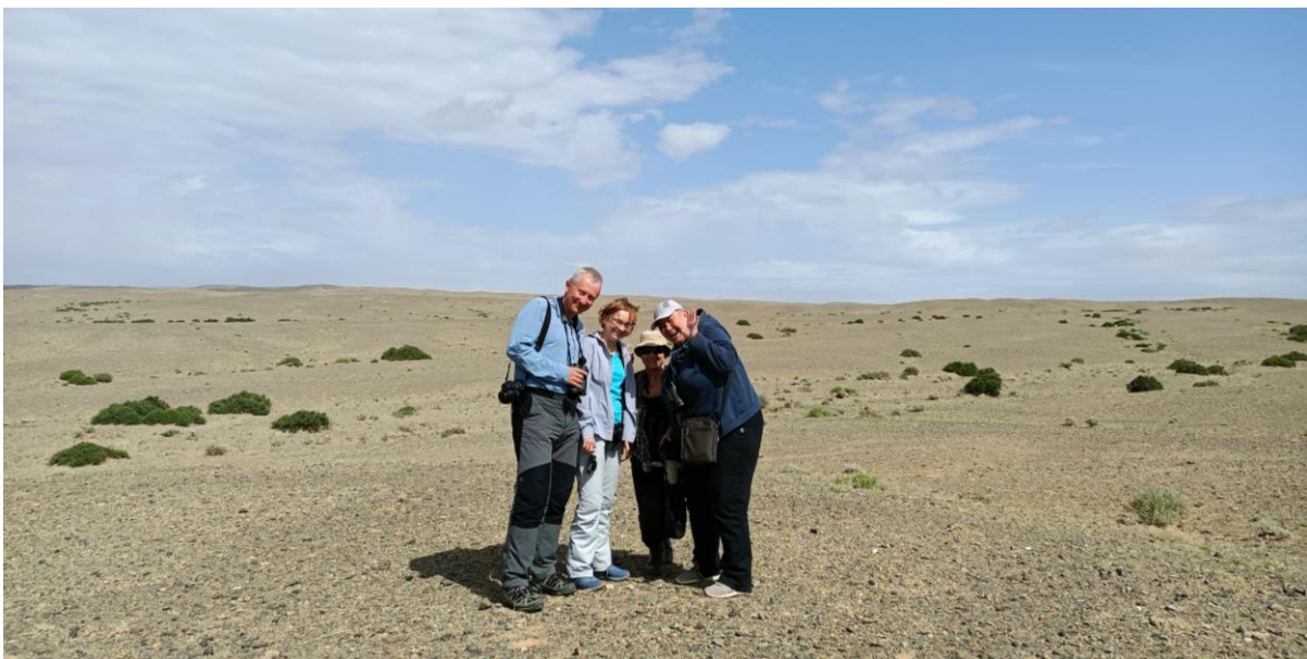
Our tour participants at the Mongolian Ground-jay habitat