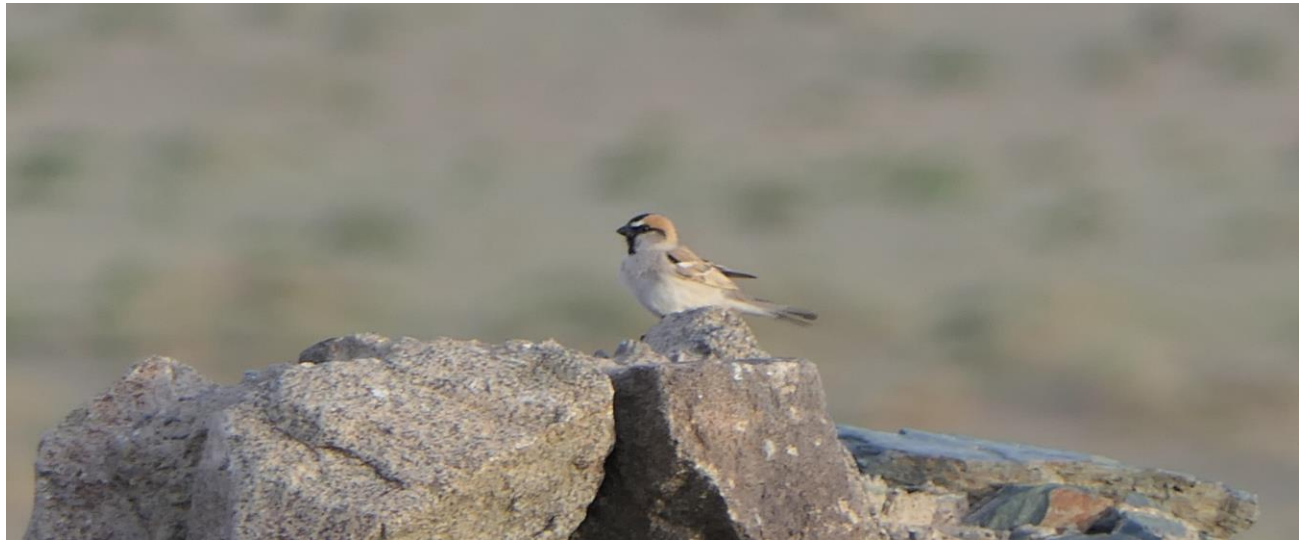
A male Saxaul Sparrow

Now we need to find other target birds like Saxaul Sparrow and Southern Grey Shrike. We drove farther south to the small river. By the bridge, there is a small patch of Saxaul forest where we saw several Saxaul Sparrows and a nest of Long-legged Buzzard. Pallas's Sandgrouse was quite common here and they frequently came to the river to drink.