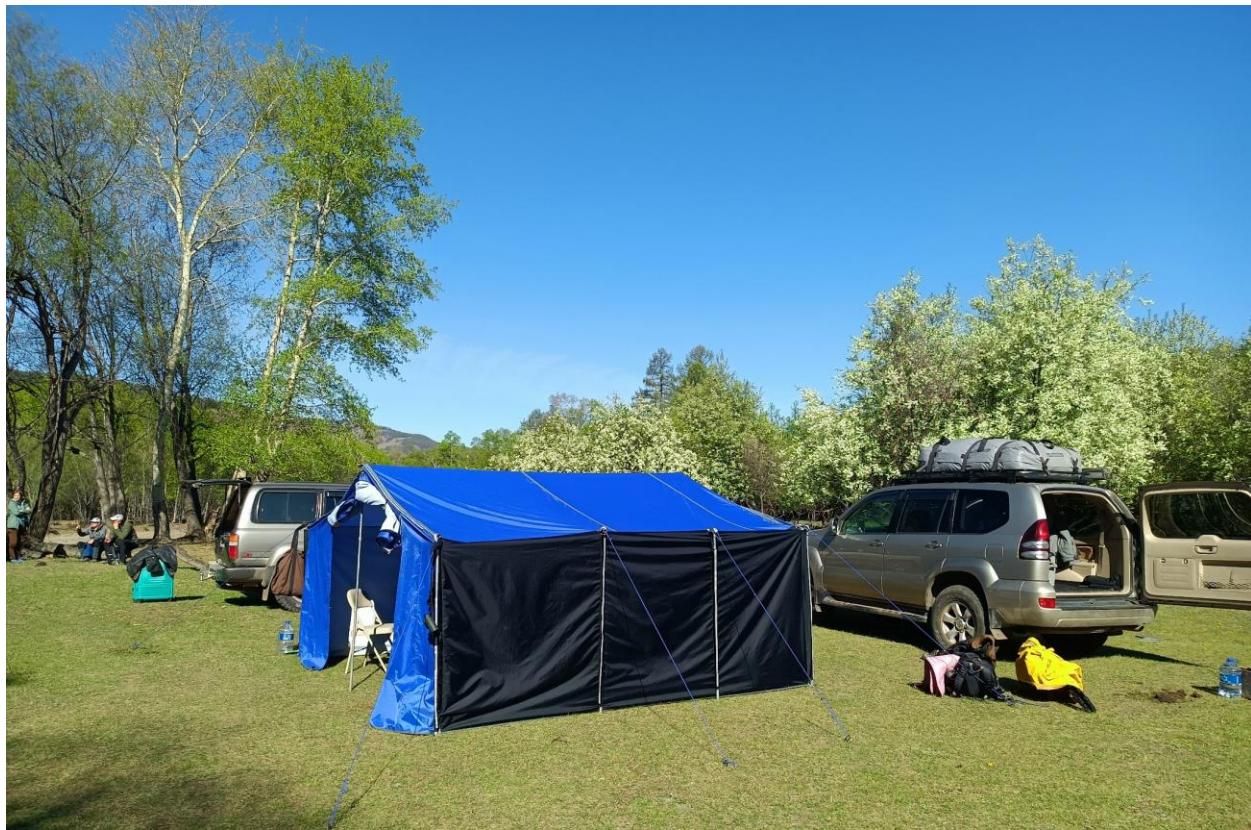
Camp site along the Terelj River