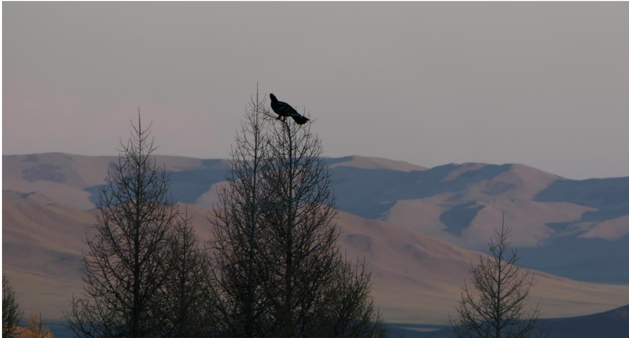
A Male Black-billed Capercaillie perched on the larch tree