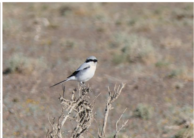
Asian Desert Warbler and Southern Grey Shrike