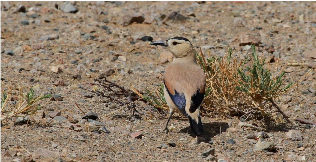
Mongolian Ground-jay

We had early breakfast as usual and went to the different dry river beds for Mongolian Ground-jay. After some hard searches, our second car encountered two Mongolian Ground-jays and everyone had an excellent view of this beautiful corvid.