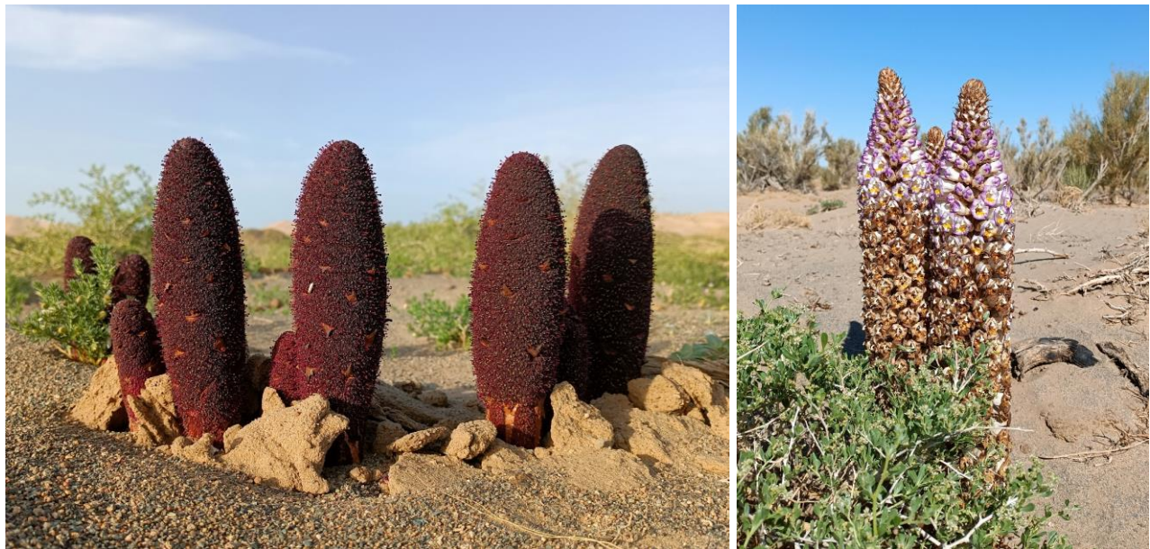
Desert Thumb and Desert Cistanche in the Gobi Desert

We continued our journey and stopped for lunch in the valley of Arts Bogd Mountain. While meal is being prepared, we heard and saw some singing Grey-necked Buntings. Another target species was just ticked. We refilled our car tanks in Bogd town and continued to drive to the Baga Bogd Mountain. We reached the camp site in Baga Bogd at around 5:00 pm.