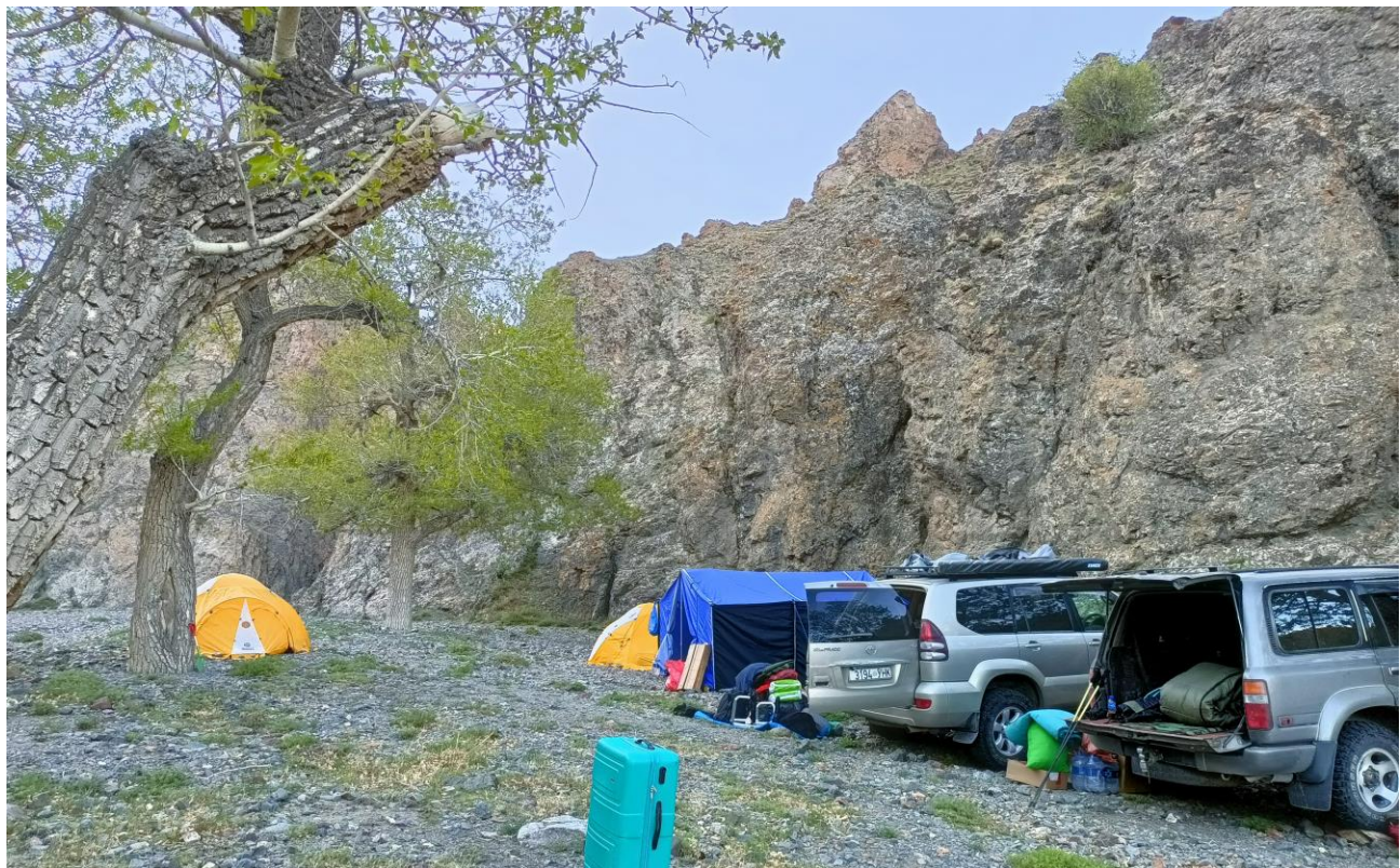
Our camp in Baga Bogd Mountain

We continued our journey and stopped for lunch in the valley of Arts Bogd Mountain. While meal is being prepared, we heard and saw some singing Grey-necked Buntings. Another target species was just ticked. We refilled our car tanks in Bogd town and continued to drive to the Baga Bogd Mountain. We reached the camp site in Baga Bogd at around 5:00 pm.