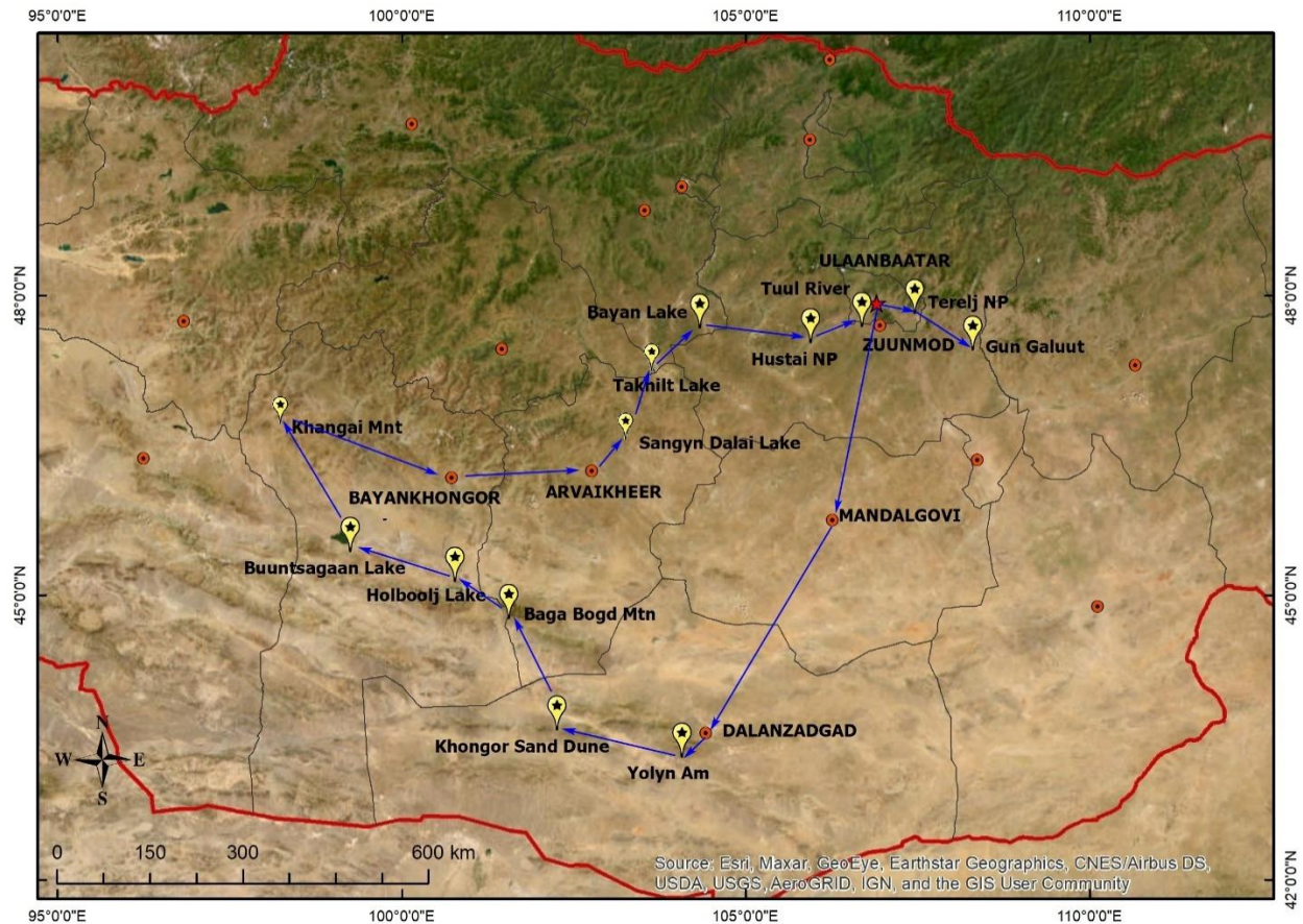
Key birding locations/trip route