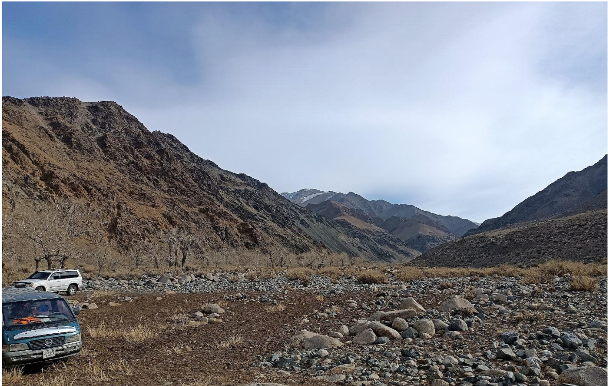
Our Snow Leopard valley