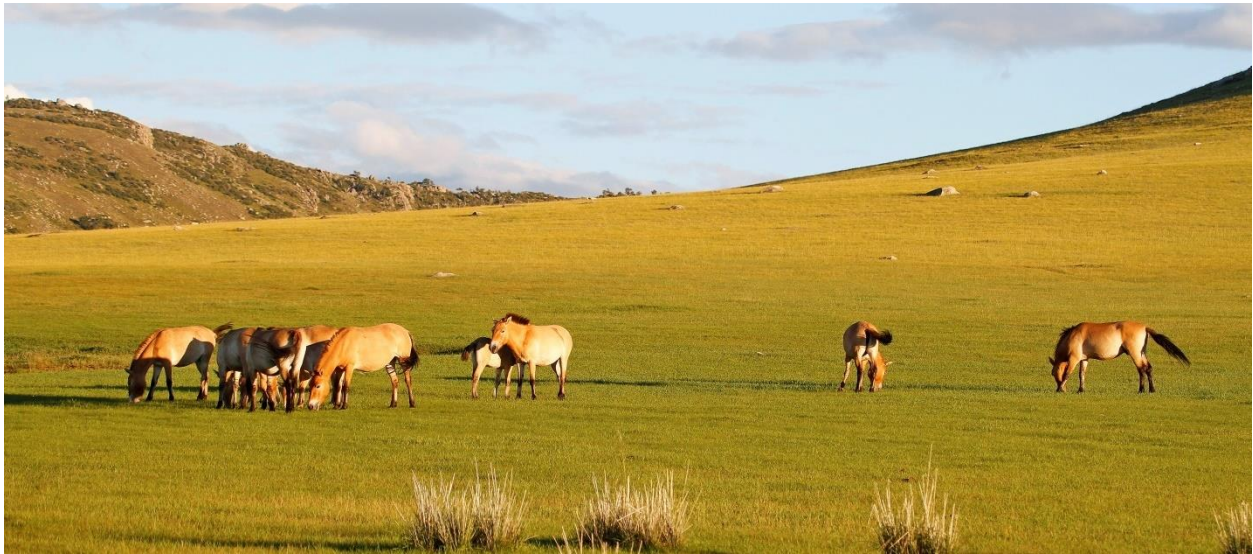
Przewalski's Horses in Hustai National Park