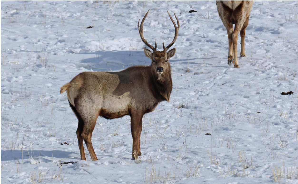
A Wapiti Deer in Hustai National Park