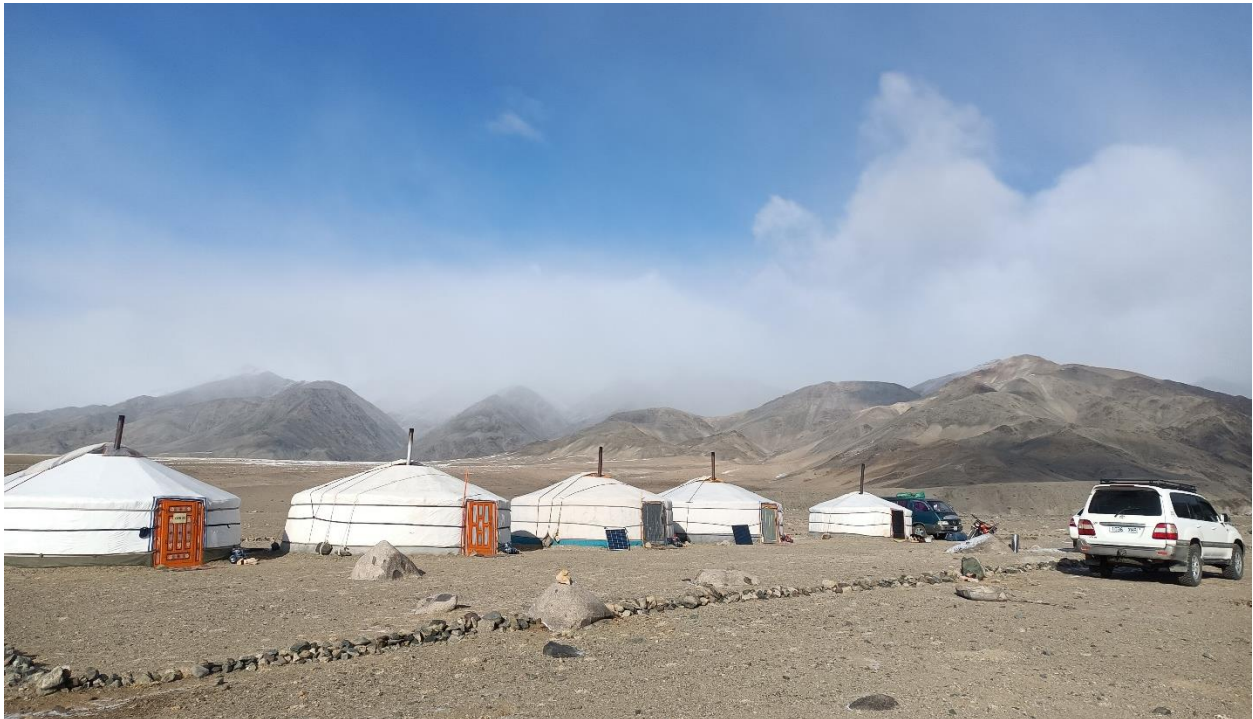
Our Snow Leopard Ger camp at the base of Altai Mountains