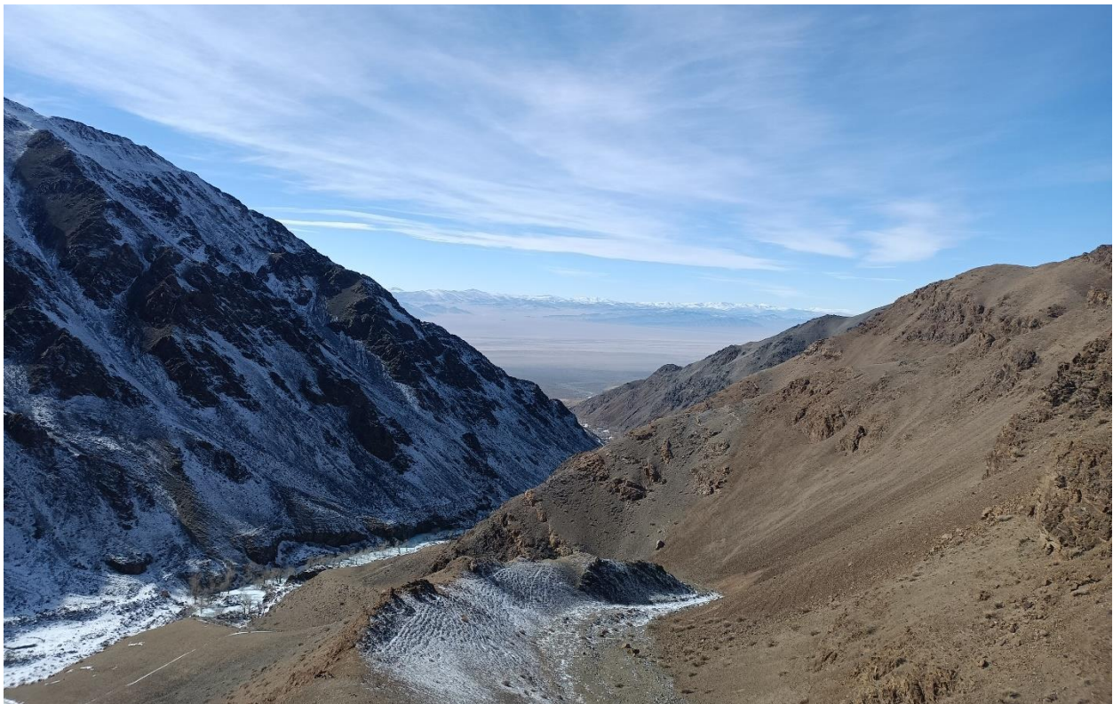
Our Snow Leopard valley