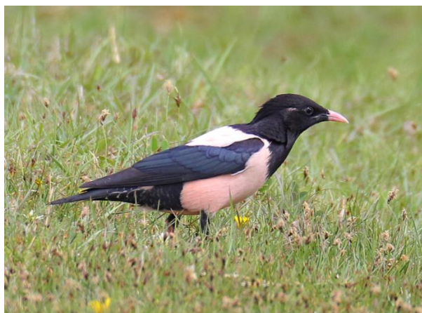
A male Rosy Starling