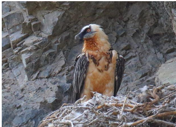
Adult Bearded Vulture on the nest