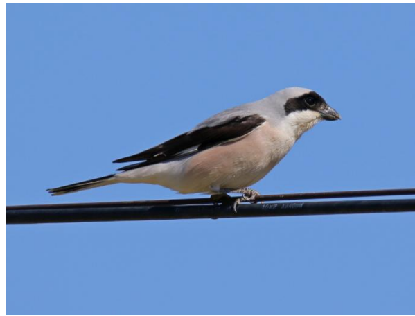
Lesser Grey Shrike