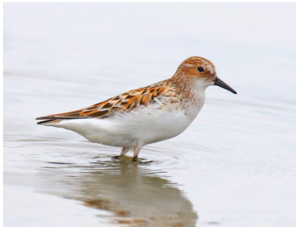
Little stint in breeding plumage