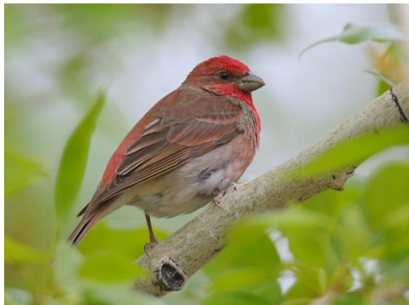
A male Common Rosefinch