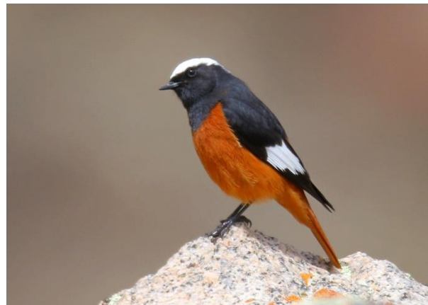
A male White-winged Redstart