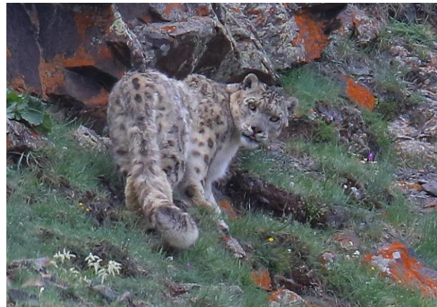
Snow Leopard – Ghost of the mountains