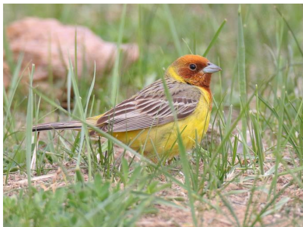
A male Red-headed Bunting