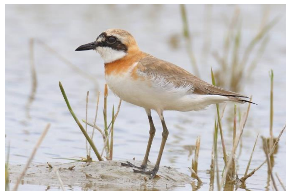
A male Greater Sandplover