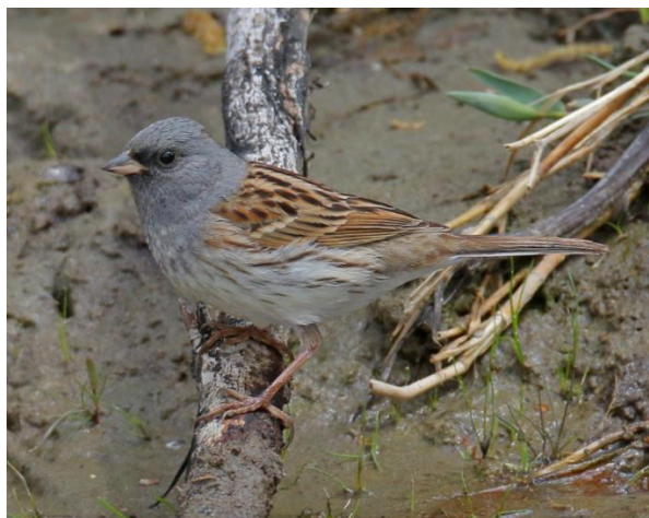
A male Black-faced Bunting