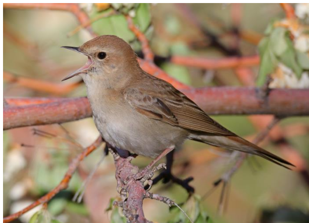
Common Nightingale (ssp. golzii )

the good photos and walked back to the camp site for breakfast. After breakfast, I went to the western part of the plantation to explore the area. Several Grey-necked Buntings were singing from the bushes and all the sudden I heard unfamiliar call of a bird. Several European Bee-eaters just came from somewhere and perched on the wire fence. I tried to get closer hiding among the bushes to take decent photos. After a few shots, all flew to the core zone of the plantation. I immediately gave a phone call to Jargal and we went to the same direction where bee-eaters have gone to. The bee-eaters were feeding on insects around large poplar trees and we were able to take more photos for next two hours. As the sun went higher, it was getting harder to get sharp images due to heatwaves. We were very excited with the bee-eaters as we did not have much expectation. Now, we need to find another target bird – Lesser Grey Shrike. We haven't seen any in the plantation where we camped. We decided to move on to the next destination as we satisfied with Common Nightingale and European Bee-eater.