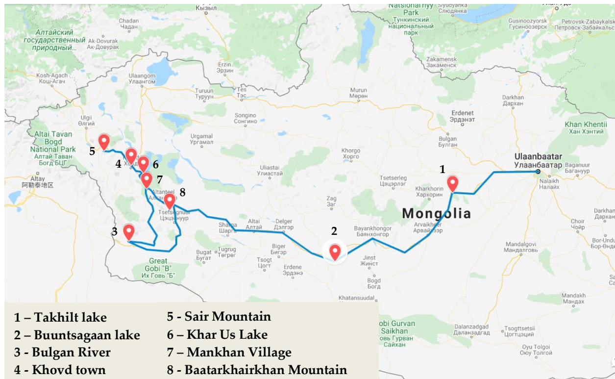
Trip route and main birding locations