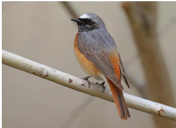
A male Common Redstart