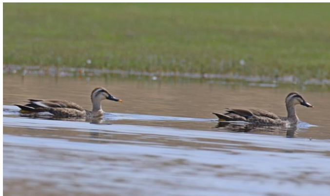
A pair of Chinese Spot-billed Duck