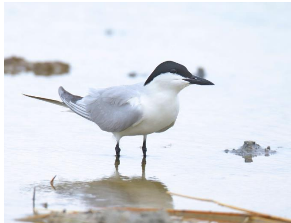
Common Gull-billed Tern