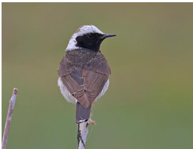
A male Pied Wheatear