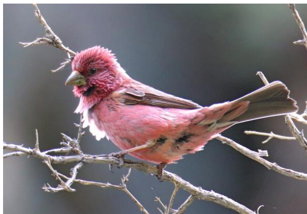
A breeding male Red-mantled Rosefinch

I have two uncles who live in one of the valleys of Baatarkhairkhan Mountain range. Baatarkhairkhan mountain range covers an area of 1,300 sq/km and its highest peak is 3,980 m a.s.l. I have other relatives who lived in the mountain as herders and I have spent my two summer vacations in the mountain when I was a child. As the valley is not entirely accessible to drive, we used motorcycles to go farther up the valley. We stopped nearby rocky slope which looked good for elusive Snow Leopards. My cousin showed us a scrape marking of Snow Leopard which was a good sign. After got off the motorcycle, I started scanning the rocky slope with binoculars and there was something like a Grey Wolf. After a few seconds it has moved and turned out to be a Snow Leopard – what a stunner! It was walking on the slope and laid down on the rock with showing its head only. It was about 200-300 m away from us and altitude of sighting was 2,250 m a.s.l. Other highlights were Red-mantled Rosefinch, Sulphur-bellied Warbler, Great Rosefinch, Grey-necked Bunting and Siberian Ibex.