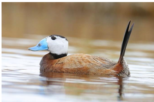
A male White-headed Duck

Our main target at Khar Us Lake was White-headed Duck. This species only breeds in several large lakes with rich reedbeds in NW Mongolia and the Khar Us lake is one of them. We went in an inflatable boat and cruised around the patches of reedbeds in most south western corner of the lake. After a while, we spotted several pairs of White-headed Ducks and we decided to wait for them to come to us hiding behind the reedbeds. Not long after, three pairs approached us and males were fighting and chasing one another. When we were about to finish, increasing wind speed gave us a signal to go back to the shore as it would get harder to row the boat. After we cleaned up our dirty legs, we drove along the shore. We enjoyed watching a pair of Greater Sandplovers, a single Little Stint in breeding plumage, and a couple of Common Gull-billed Terns. Other birds on the lake were Common Pochard, Red-crested Pochard, Tufted Duck, Great Crested Grebe, Bearded Tit, Great White Egret etc. We headed back to the Khovd town via Khongilt Canyon (one of the 70 IBAs) and we saw several Grey-necked Buntings, Desert Wheatears and a Red Fox at the entrance of a small cave.