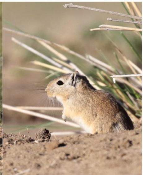
Przewalski's Horse (top left), Daurian Pika (top right), Mongolian Marmot (bottom left) and Mongolian Gerbil