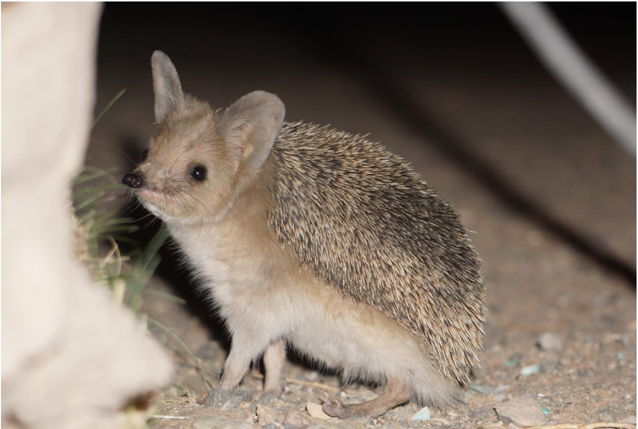
Long-eared Hedgehog (Munkhnast Dalannast)