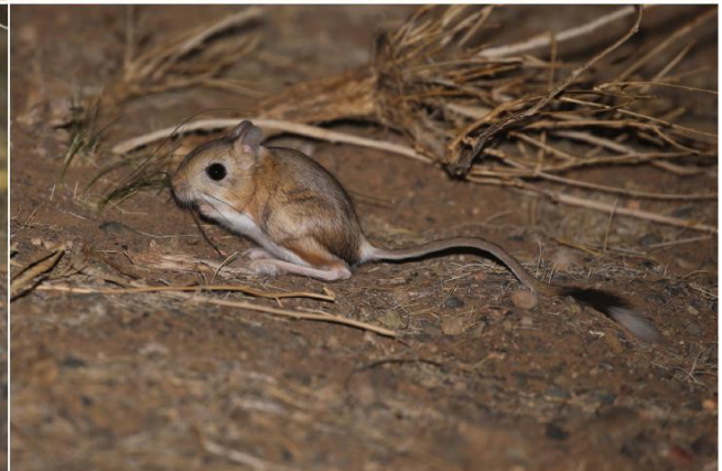
Gobi Jerboa (top left), Siberian Jerboa (top right, bottom left) and Three-toed Jerboa near Khongoryn Els