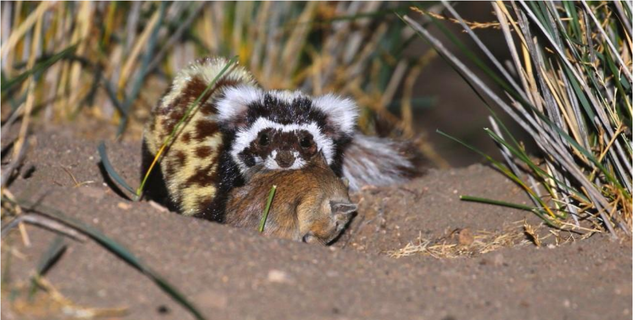
Marbled Polecat with a Mongolian Gerbil catch (János Oláh)