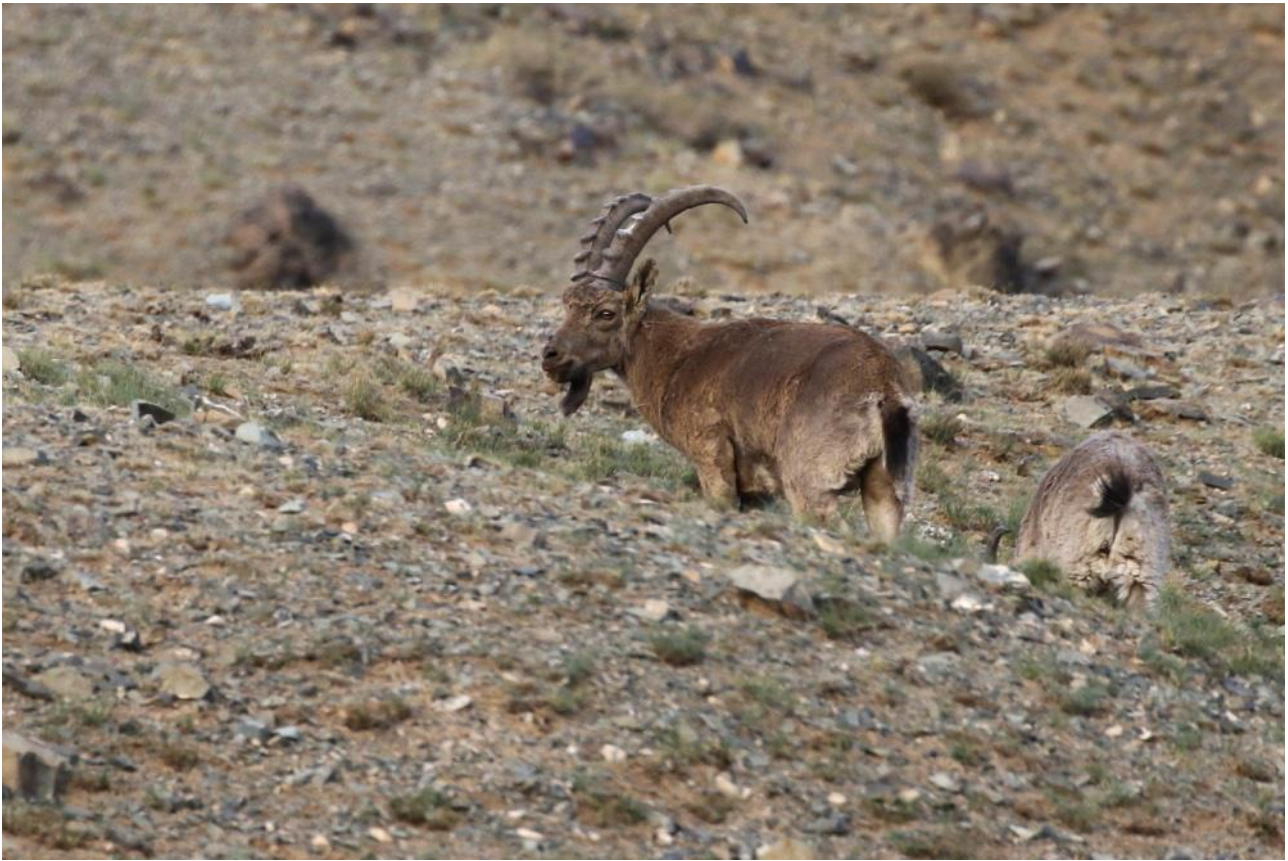
Siberian Ibex in the Gobi-Altai Mountains