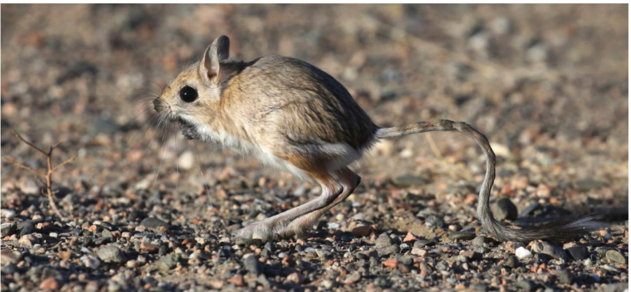
Pallas's Pika (top) at Yolyn Am and Andrew's Jerboa near Boontsagaan Lake – look at the fat-deposits on the tail, a good ID feature as well