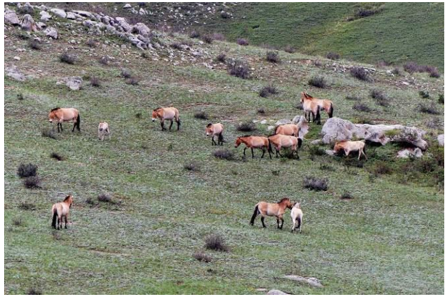
Przewalski's Horse