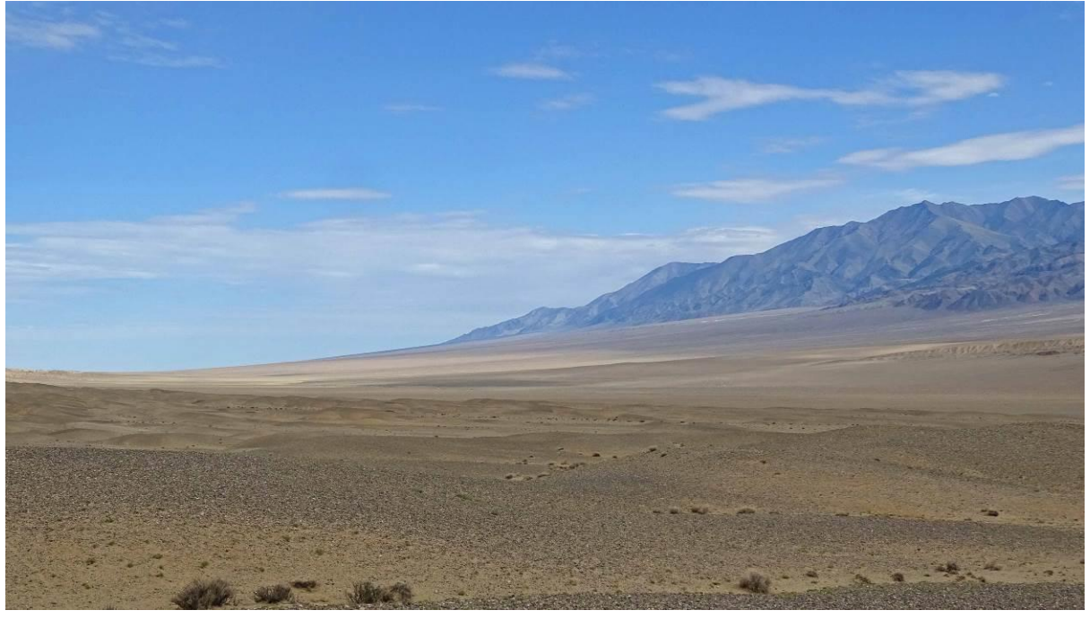
Ger Camp