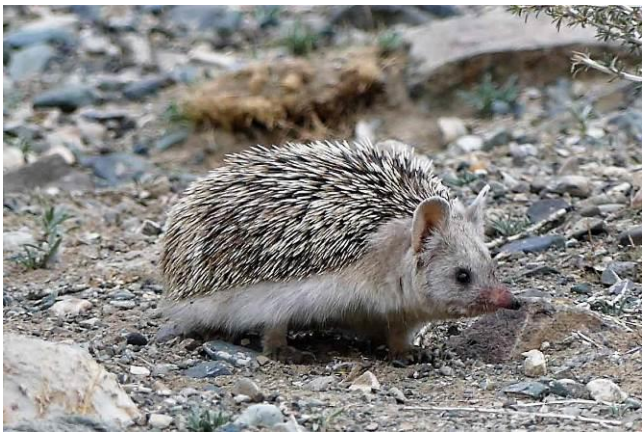
Long-eared Hedgehog