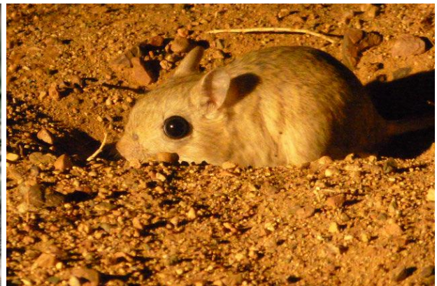
Northern Three-toed Jerboas (Nigel Goodgame/Richard Webb)

Corsac Fox Vulpes corsac - Three singles between our campsite 80 kms east of Bayankhongor, and Bayankhongar, (JP and JW also saw them in the same area on the pre-trip extension) and two singles on route from Sevrey Mountain to Ulaan Khuree.