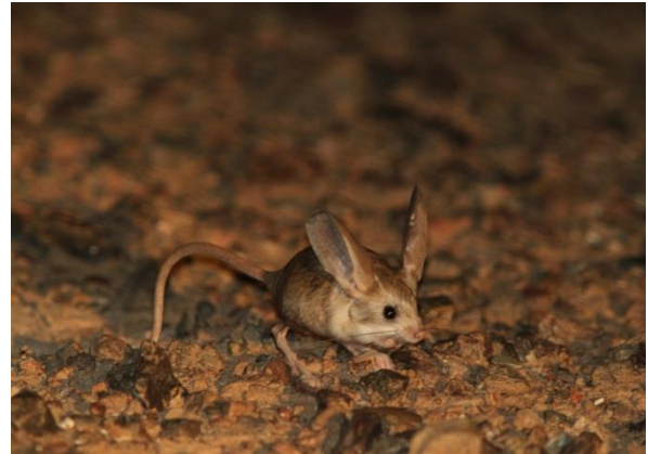
Long-eared Jerboa

Andrew's Three-toed Jerboa Stylodipus andrewsi - One caught by hand at Ulaan Khuree and two other probables seen.