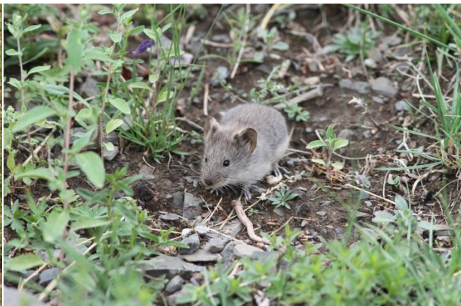
Mongolian Silver Vole (Nigel Goodgame)

Mongolian Gerbil Meriones unguiculatus - A total of at least 20 at three locations within Yolyn Am Valley, the dark claws being readily visible in the field and photos.