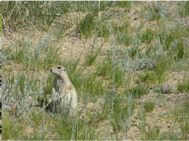
Red-cheeked Ground Squirrel