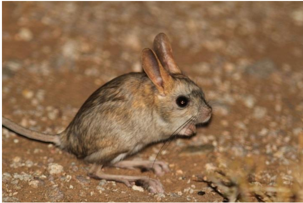
Siberian Jerboa