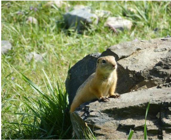
Long-tailed Ground Squirrel