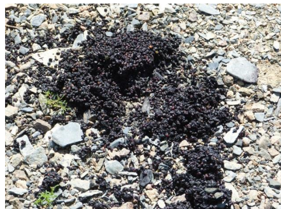
Slightly older droppings