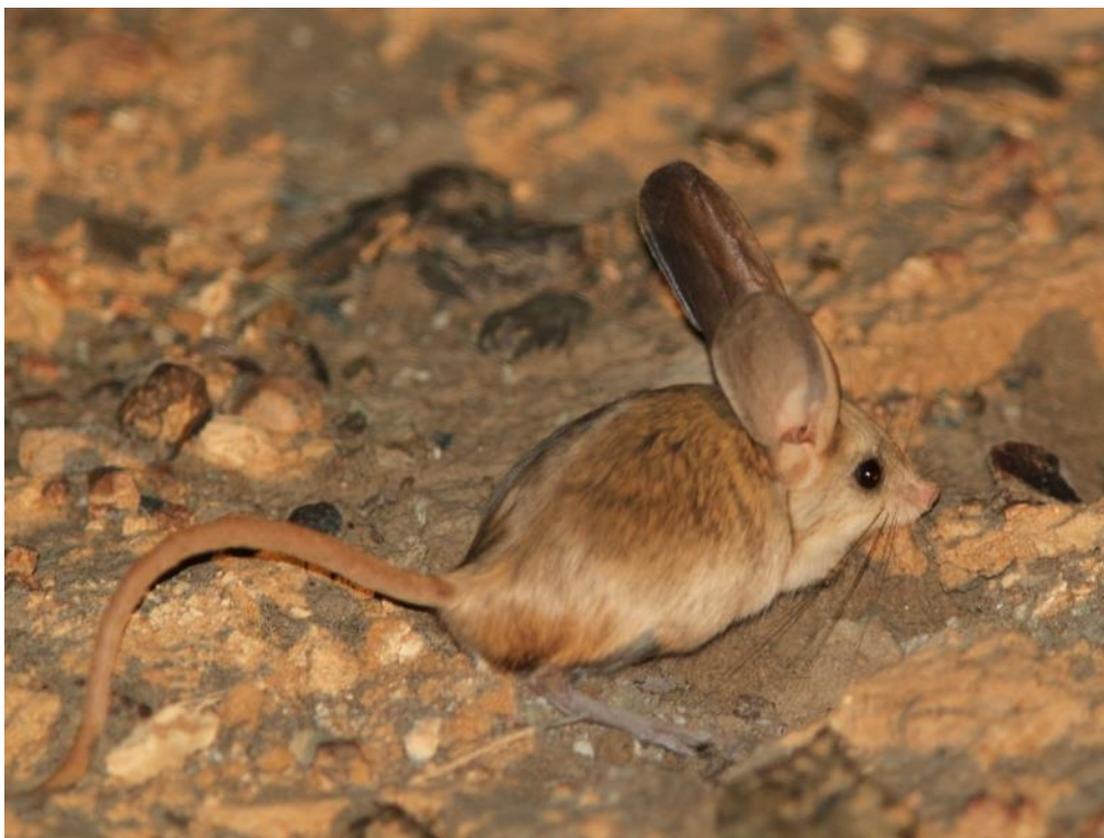
Long-eared Jerboa