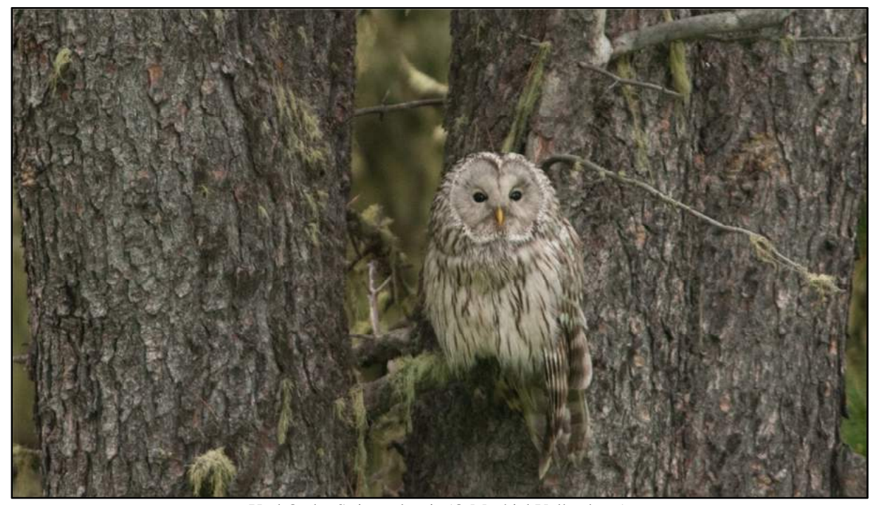
Ural Owl – Strix uralensis

Our journey continued southwards towards the Chuya plains and at every turn we became more and more amazed at the impressive landscapes of the Russian Altai. A perched adult Imperial Eagle must have been the highlight of our drive for many and several sightings of Demoiselle Cranes were equally interesting. For three nights we lodged in beautifully decorated yurts, nomad dwellings from the times of Genghis Khan. We made day excursions to Tabozhok and Beltir in search of high mountain birds, which we found in good numbers. On both days the scenery was splendid and our 4WD cars proved to be essential in the rough terrain. Brown and Altai Accentors were found on several occasions and sometimes gave walk away views. On the mountain lake near Beltir we found our first Siberian Scoters, very amiable birds. While searching for Altai Snowcock, which we unfortunately never found, we came across some colorful Güldenstädt's Redstarts and many Water Pipits of the 'blakistoni' race. At a colony of Pale Sand Martin we also found a Eurasian Hoopoe and a group of four Pallas's Sandgrouse, which we scoped for over ten minutes near to the village of Kosh Agash, are worth mentioning as well. Many Black Vultures and a single Lammergeyer were showing wonderful.