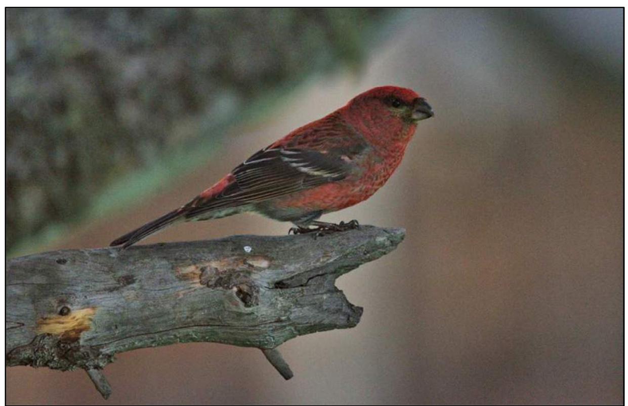
Pine Grosbeak – Pinicola enucleator