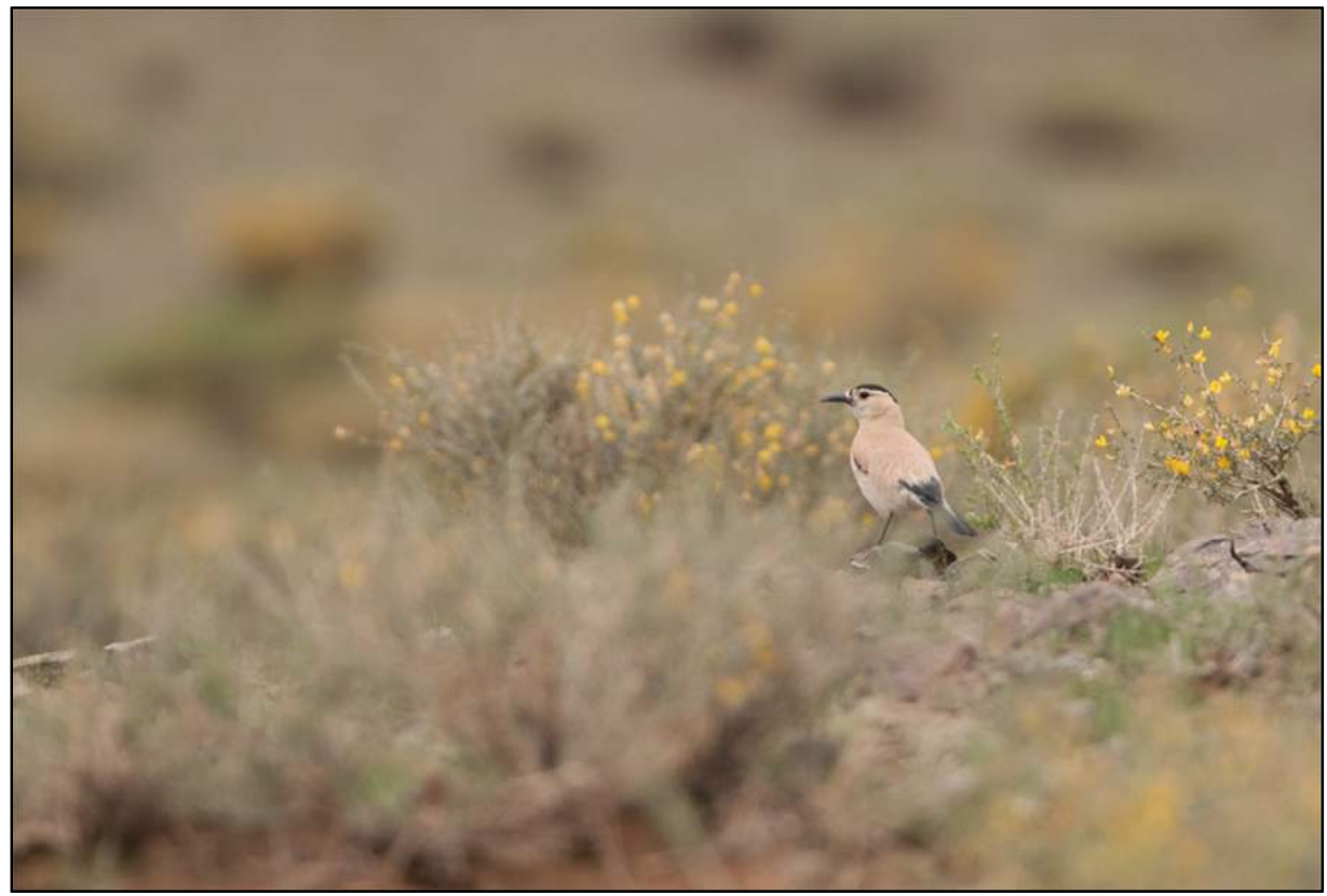
Mongolian Ground Jay – Podeces hendersoni

On the sandbanks we found Mongolian Gulls in a group of gorgeous Pallas's Gulls and Caspian Terns; the terns looked really small compared to the size of the Pallas's Gulls. High above the lake circled an adult Pallas's Fish-eagle with its distinctive tail pattern and long neck. What a heck of a bird!! We returned back to the Russian border and crossed back into Russia, staying again for a few nights at the delightful yurt camp.