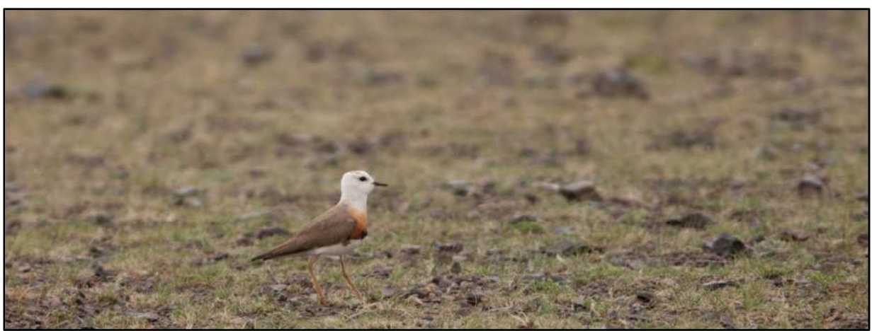
Oriental Plover - Charadrius mongolus

• Website <u>www.rubythroatbirding.com</u> • contact <u>machiel@rubythroatbirding.com</u> • ALL INCLUSIVE NATURE TOURS IN CENTRAL ASIA AND SIBERIA