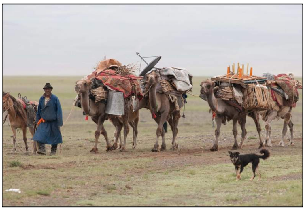
Mongolian caravan, note the satellite dish!