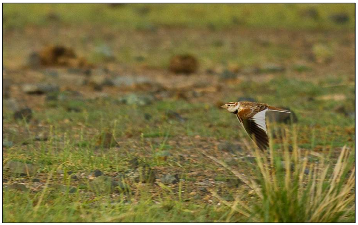
Mongolian Lark – Melanocorypha mongolica

The first lake we toured was Lake Achit Nur, which was also the largest lake that we would visit, followed by Lake Khar-Us-Nur and a small saline lake which we dubbed Relict Gull Lake, and you may guess why! The stone deserts nearby Lake Achit Nur were dotted with small bushes and proved to be the perfect habitat for one of the most sought after species of this special country: the incomparable Henderson's Ground Jay!! Soon we found Greater Sand Plover, Daurian Shrike and many Horned Larks closer to the lake. The lake was full with waterbirds: Black-throated Loon, Goldeneye, Goosander, Smew, Red-crested Pochard and more Bar-headed Geese. One of the best sightings here was surely a couple of elegant Swan Geese! While a White-tailed Eagle patrolled the air, we found along the Khovd River an adult male Long-tailed Rosefinch, which showed very well; the contrast between the white wing and reddish body made this the bird of the trip for some. Large mixed flocks of foraging Common and Pacific Swifts came close and some of us tried photographing these fast birds.