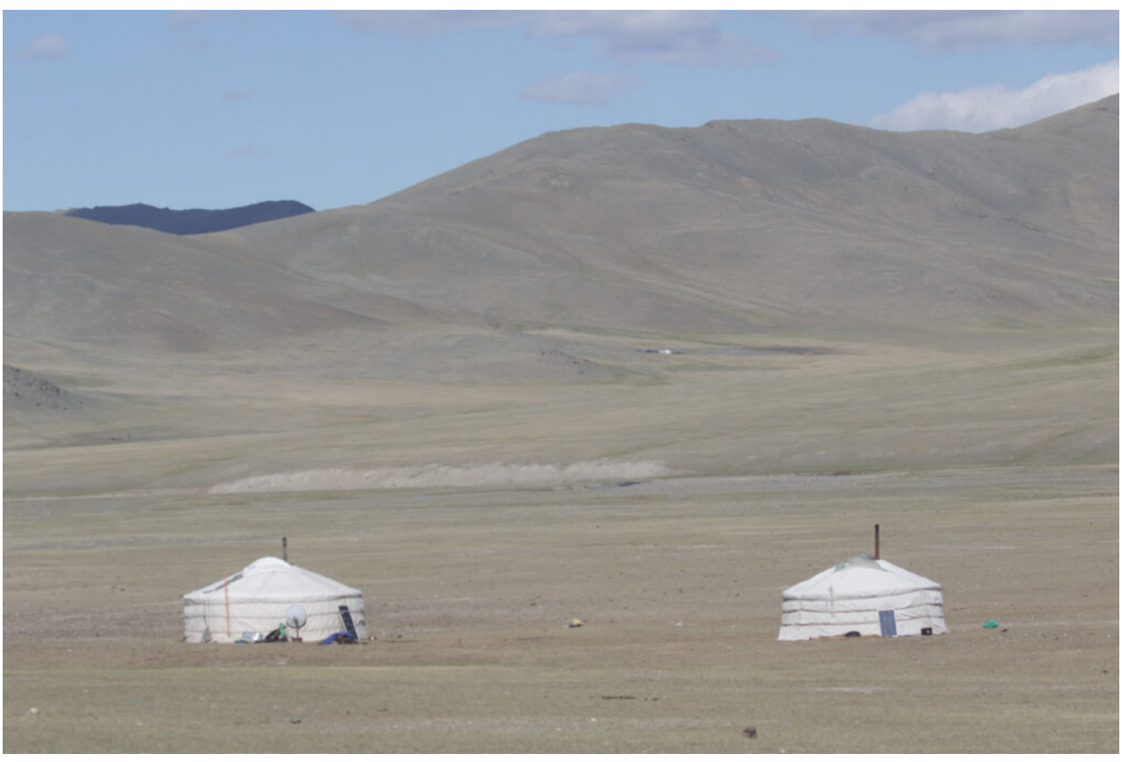
Typical Mongolian Scene