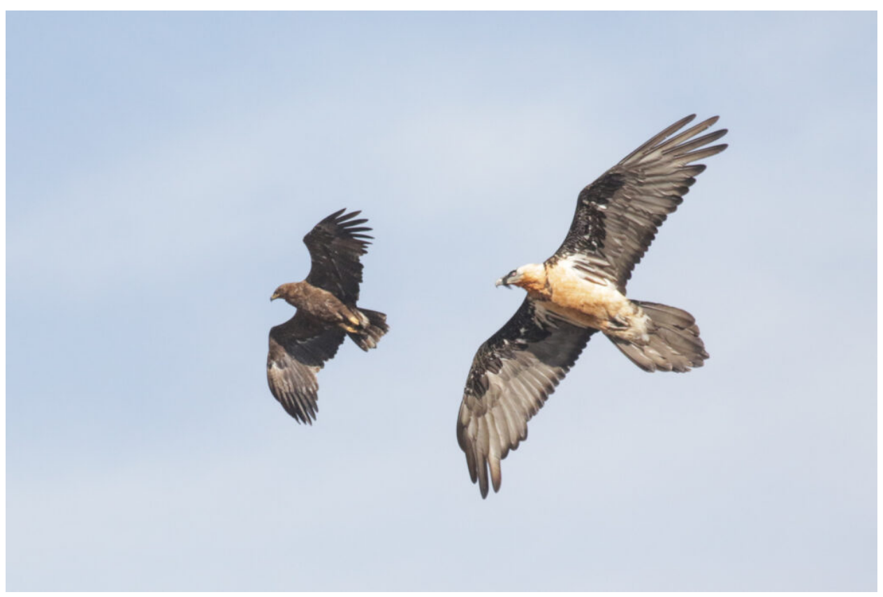
Bearded Vulture with Steppe Eagle