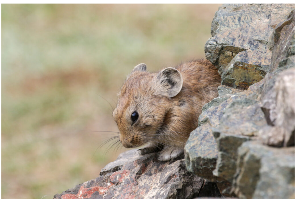
Pallas's Pika