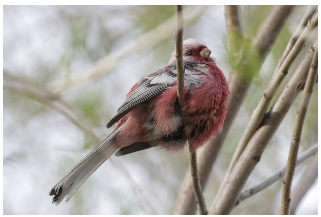
Long-tailed Rosefinch