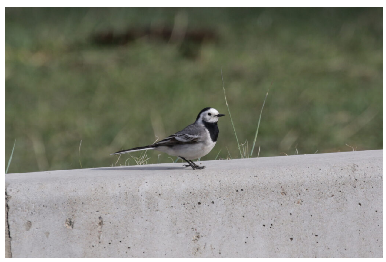
White Wagtail ssp baicalensis