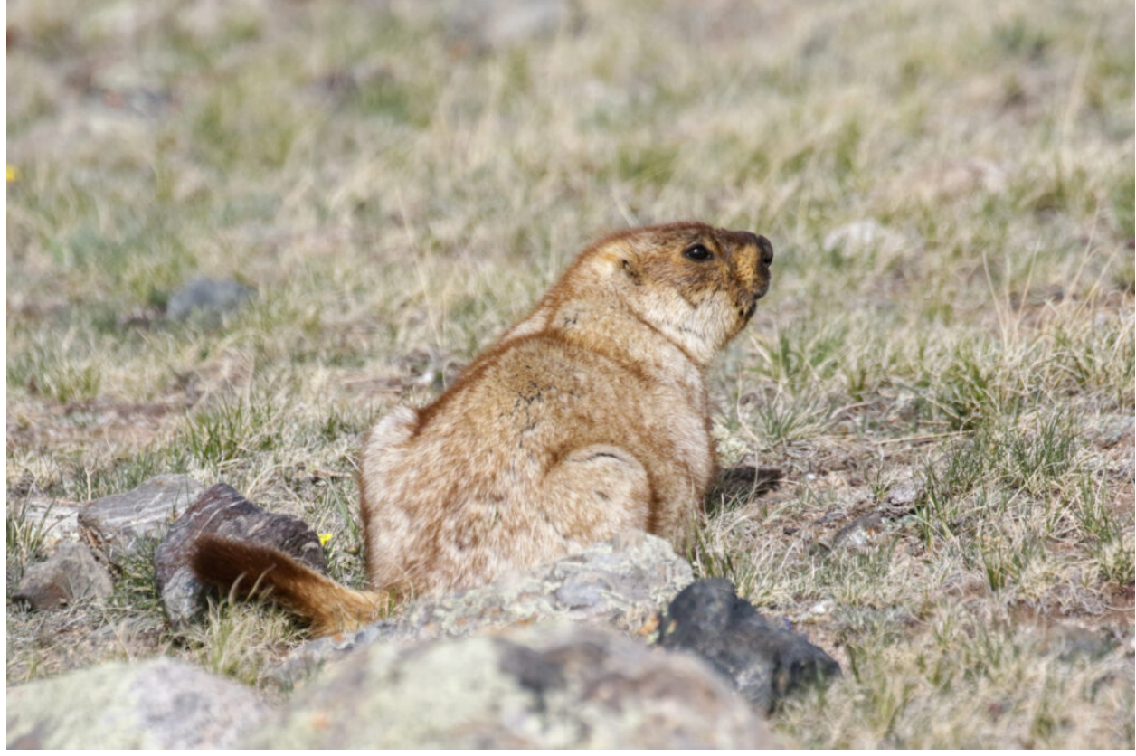
Tarbagan Marmot