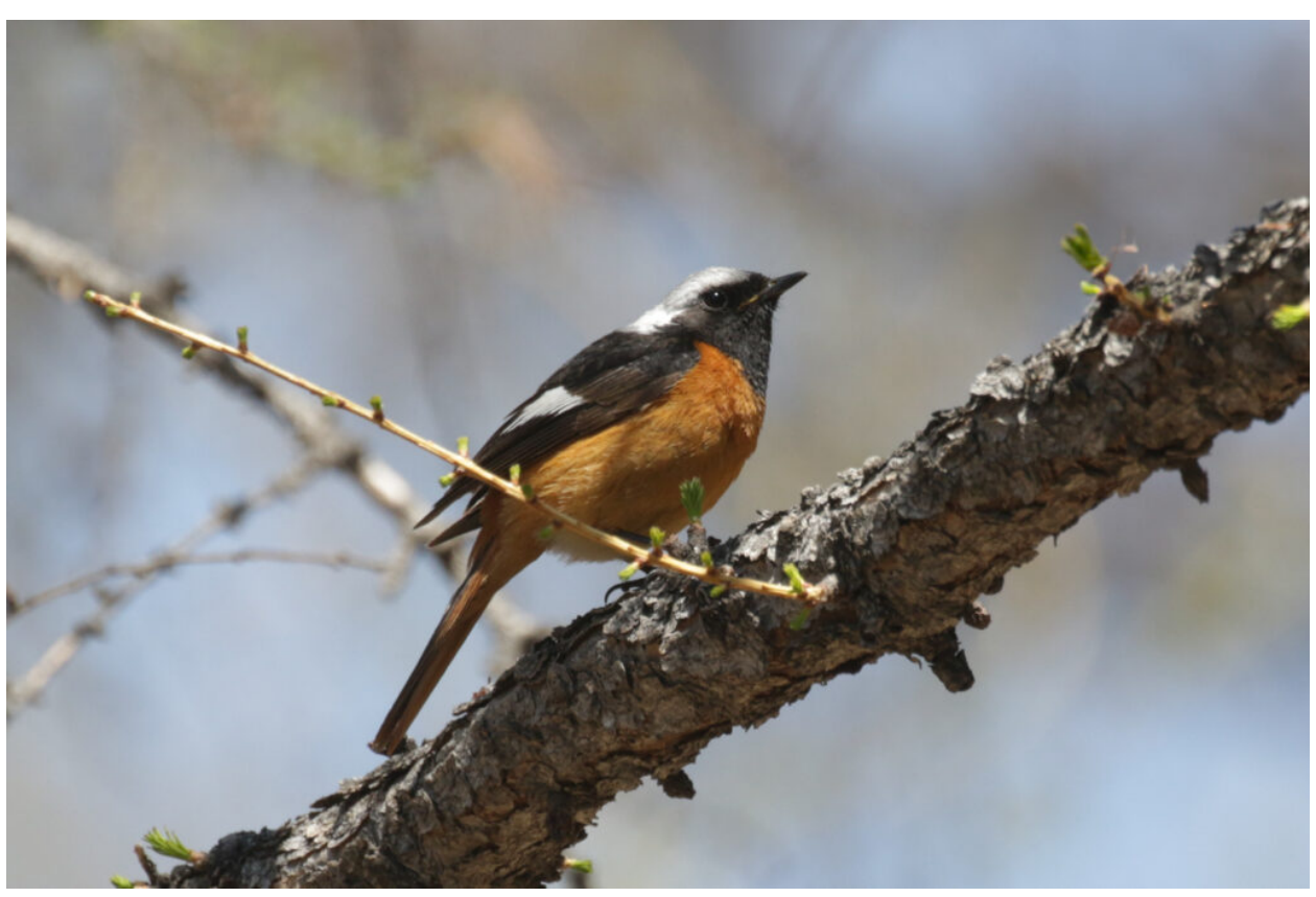
Daurian Redstart