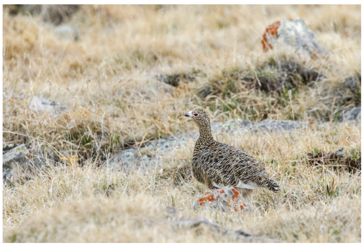
Willow Grouse