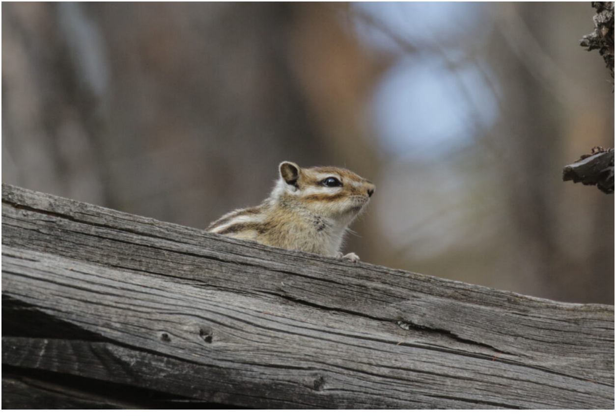
Siberian Chipmunk