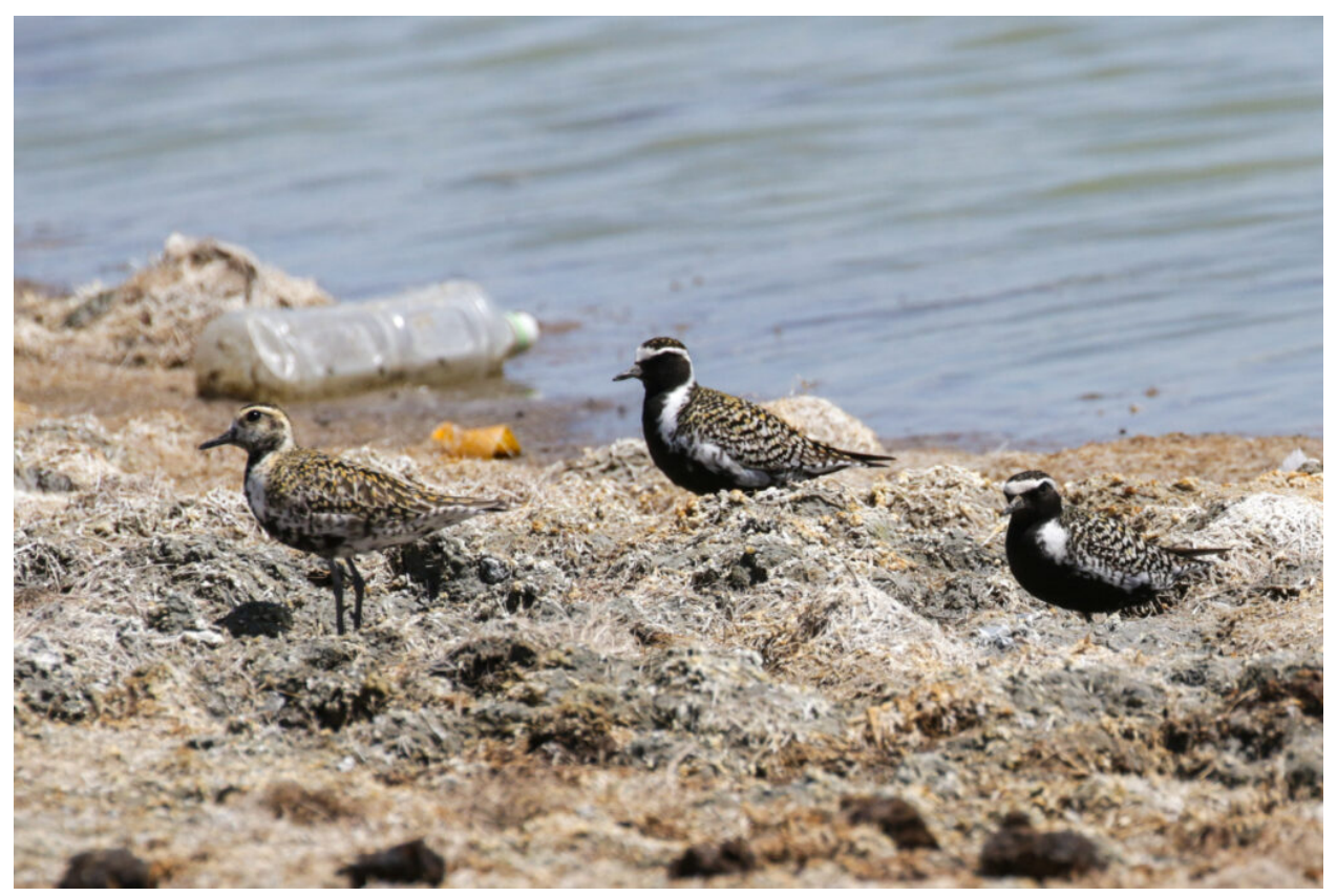
Pacific Golden Plovers