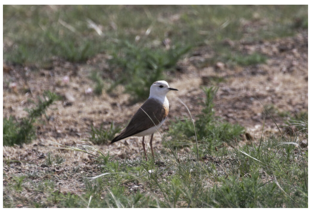
Oriental Plover