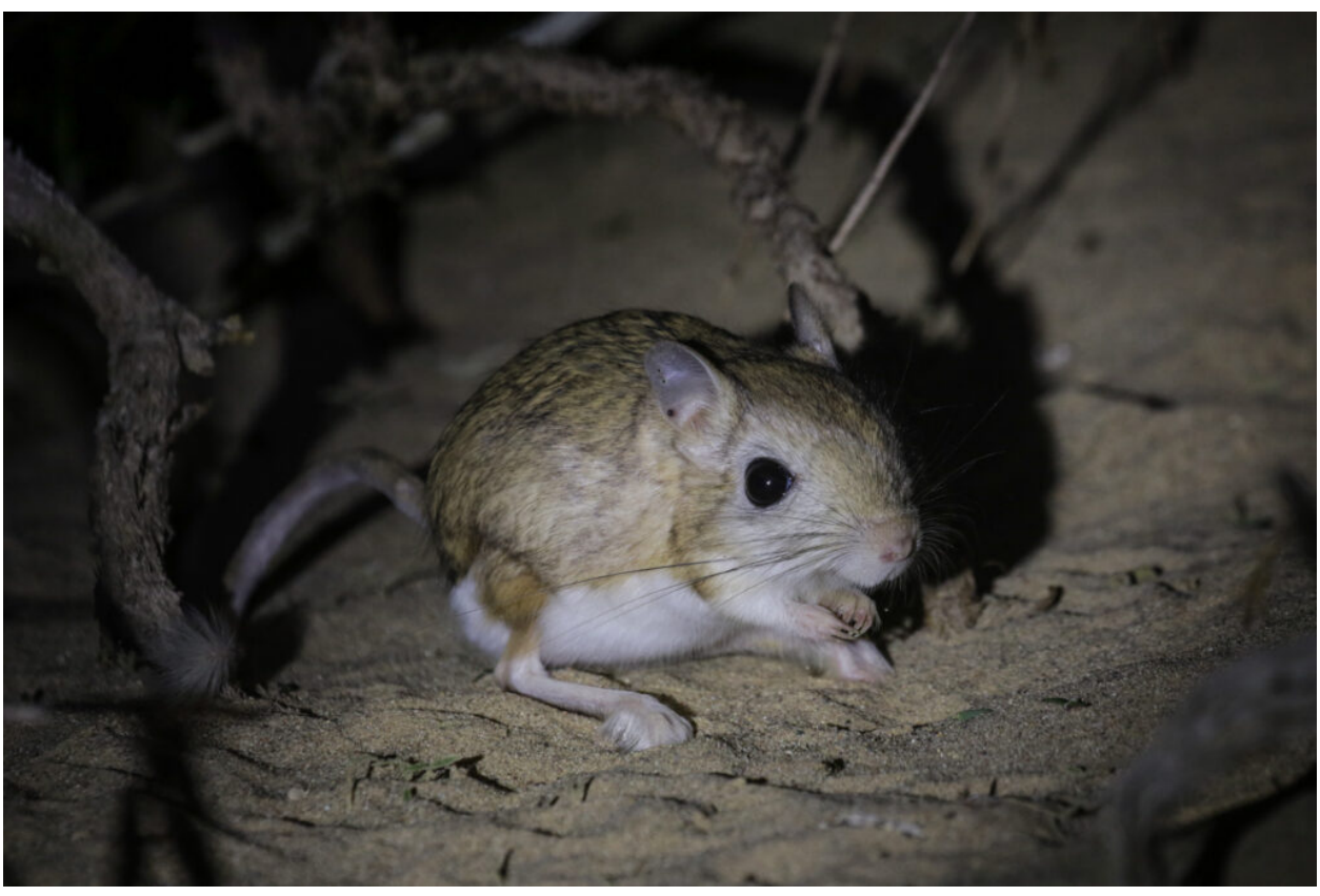
Northern Three-toed Jerboa