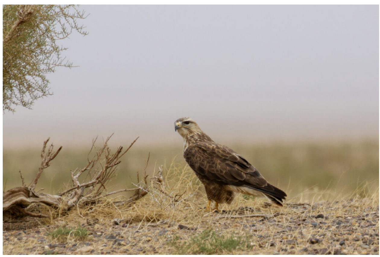
Upland Buzzard