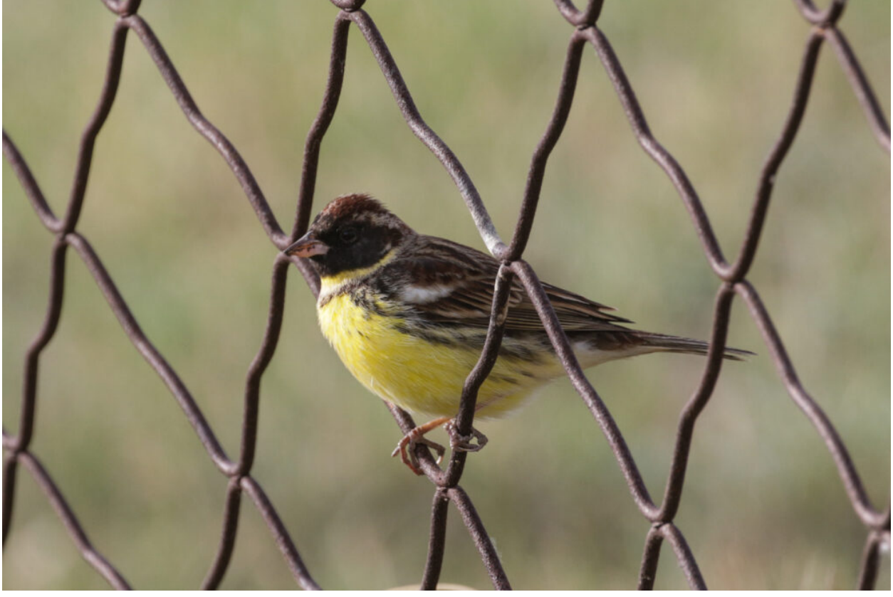
Yellow-breasted Bunting