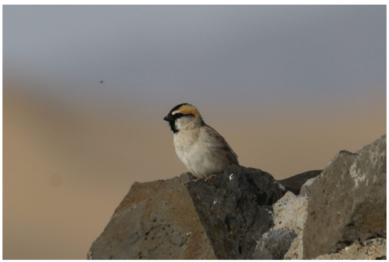
Saxual Sparrow