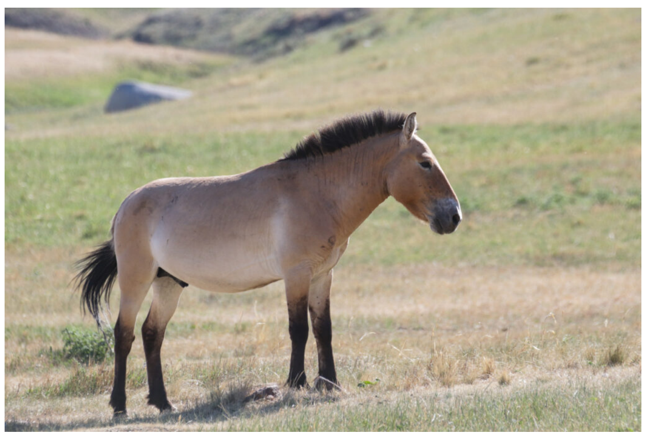
Wild Horse