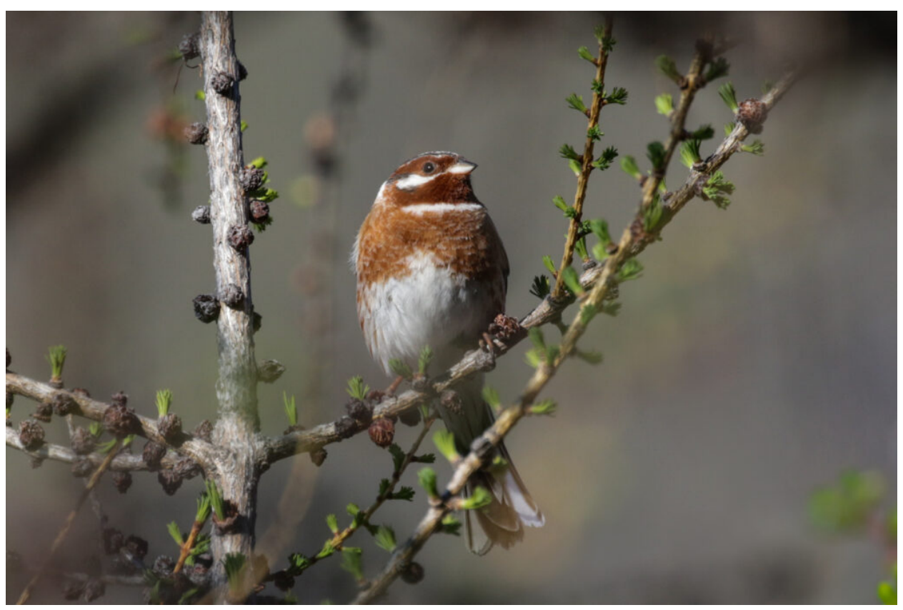
Pine Bunting