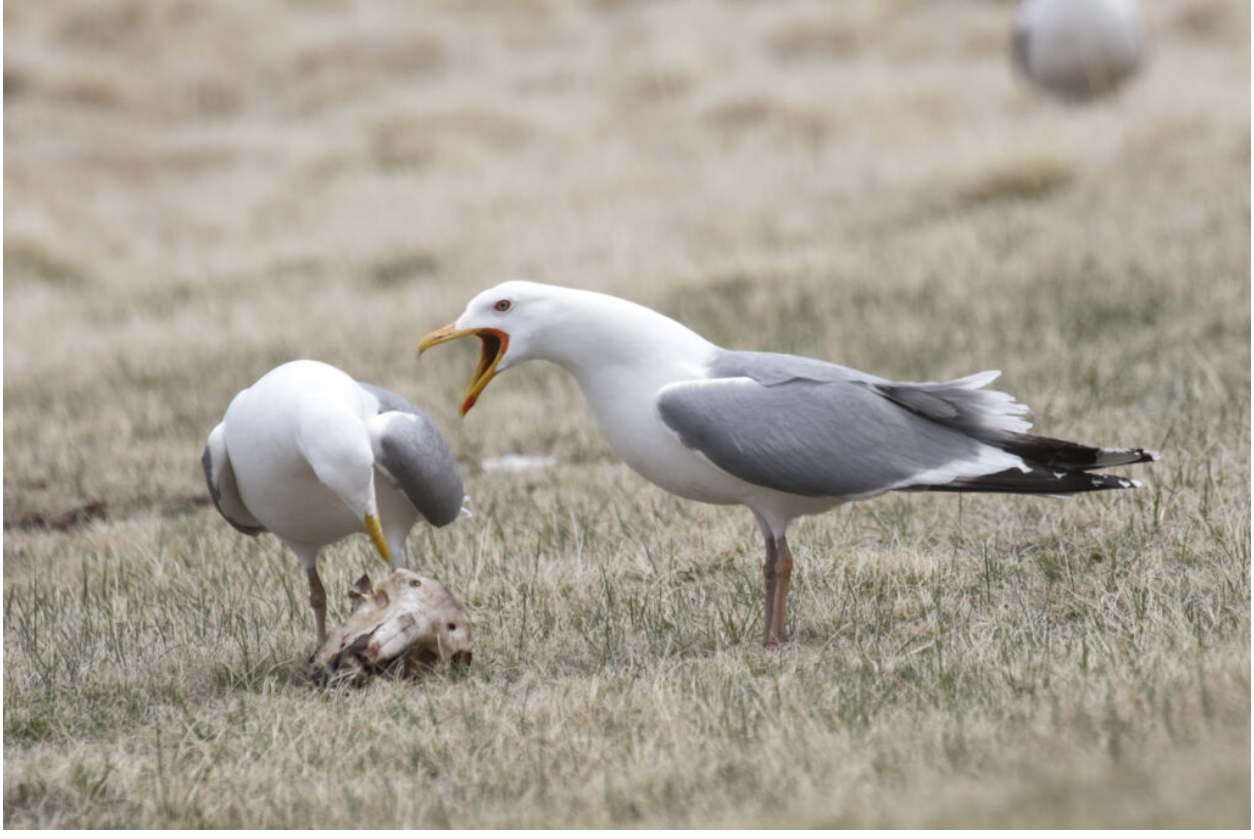
Mongolian Gulls