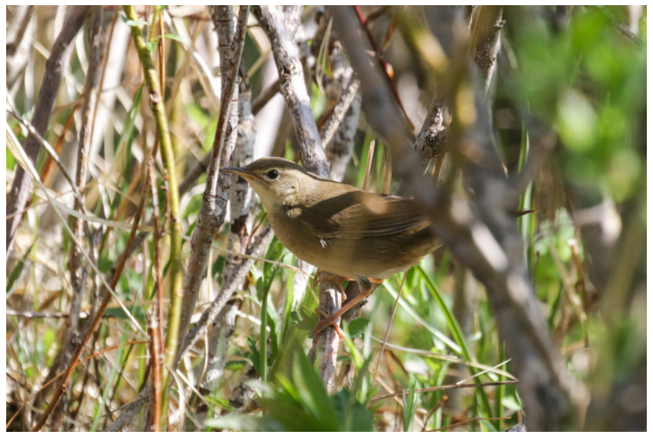
Chinese Bush Warbler