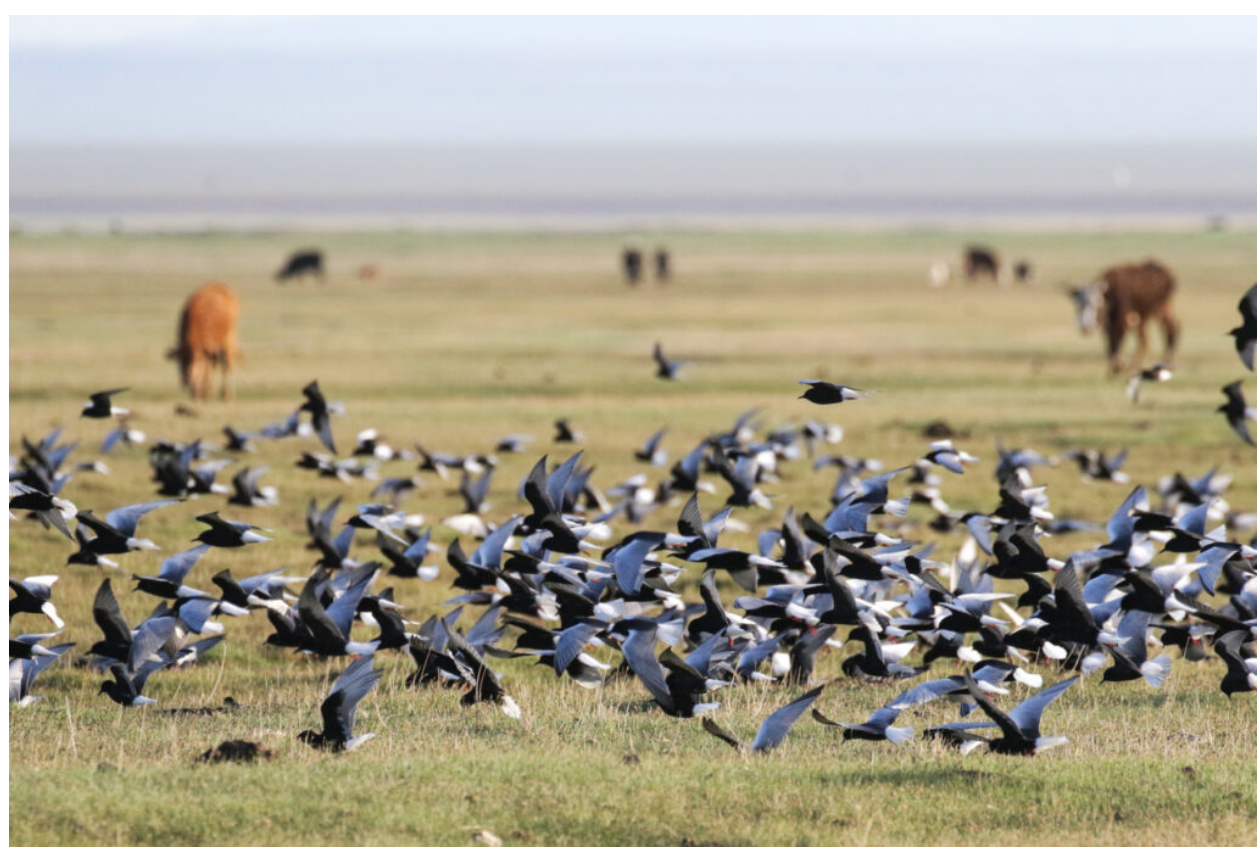
White-winged Terns