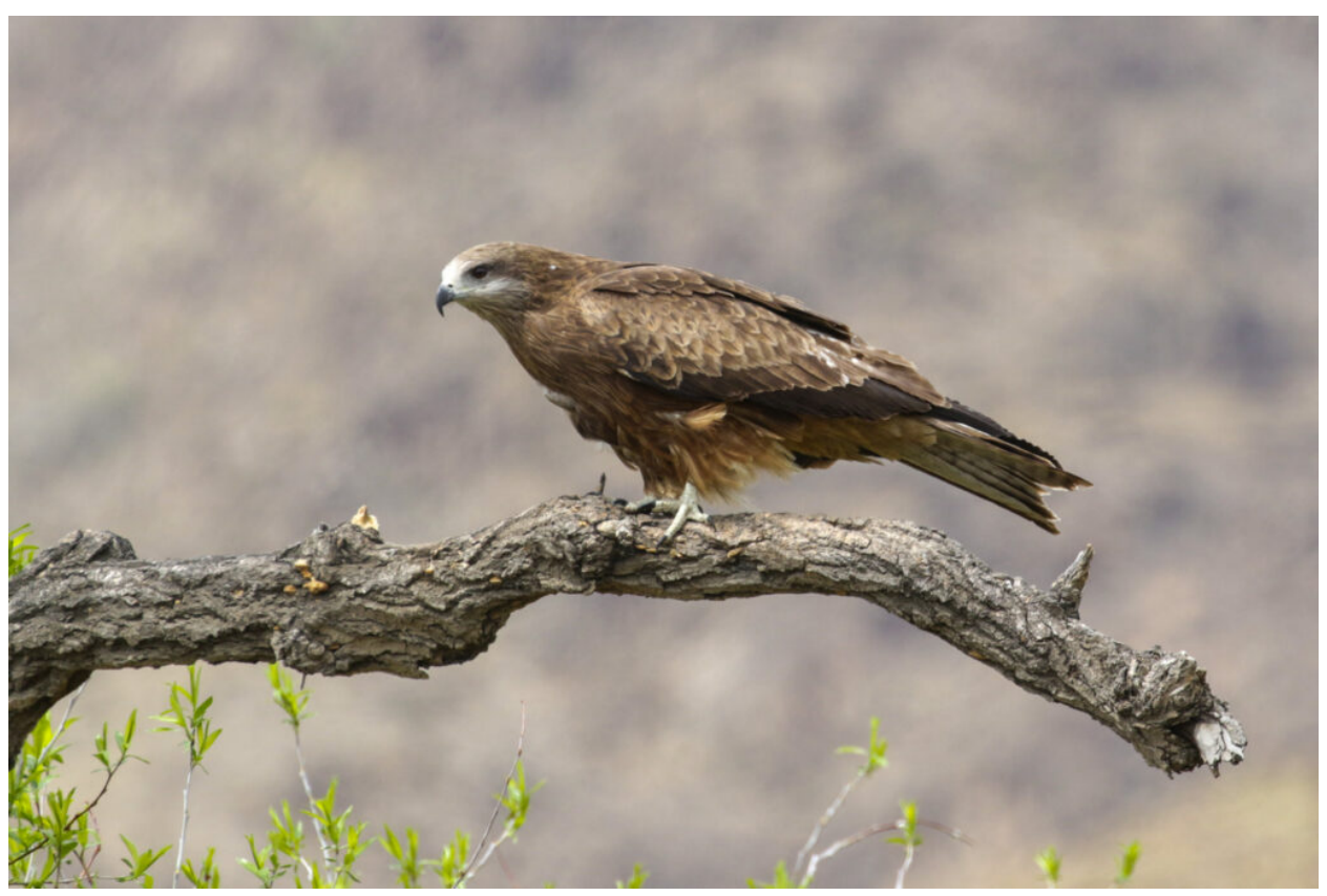
Black Kite ssp lineatus