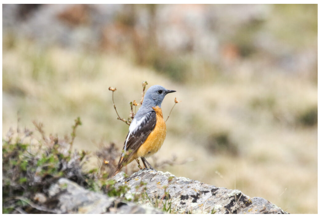
Common Rock Thrush