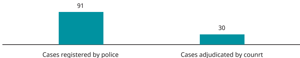
Graph 1. Registered and Adjudicated Cases

In the past 10 years, courts have found 59 individuals involving in 30 cases guilty and sentenced them for TIP. 7 They reviewed 91 cases registered with the police involving 68 people. Out of 91 cases registered with the police, courts adjudicated 30 of them, which is 31.8%, and 64.1% of them were convicted by court for committing TIP. The data of courts deciding that it was a victim of TIP have been released since 2018 by each crime classification; thus, it is impossible to find data of victims of crimes resolved by court in 2013-2017, and instead it was found that there were 55 victims in 2018-2022. 8